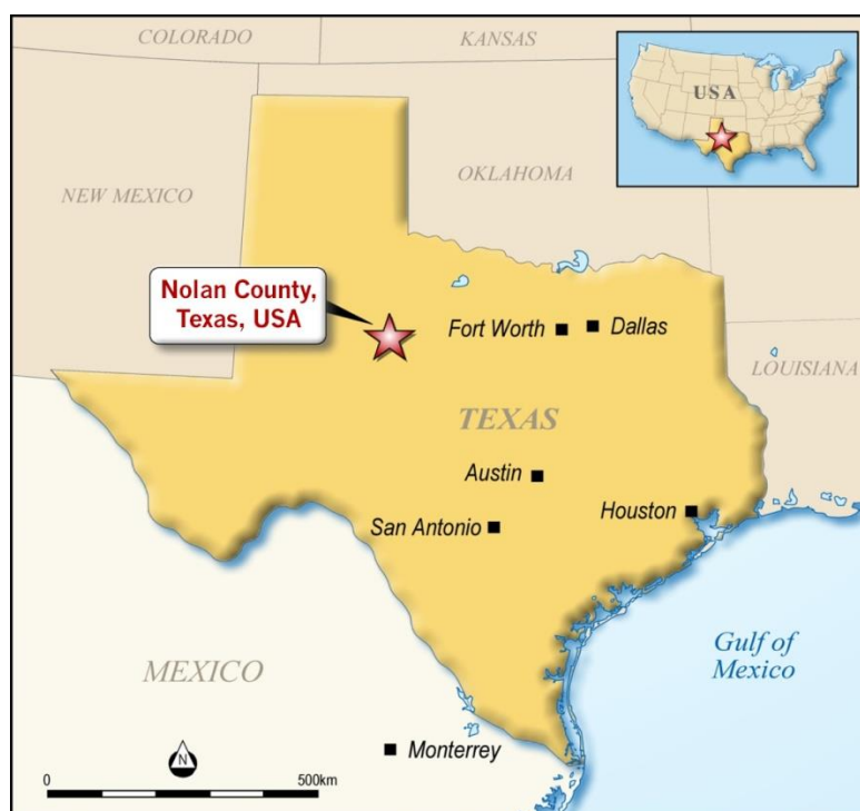
Location of the Company's 19,110 net acres in Nolan County, Texas, USA

* Please note that all production from the White Hat lease is subject to royalty payments of 23.5% to the oil and gas rights owners of the White Hat ranch. The figures represented above are pre-royalty.