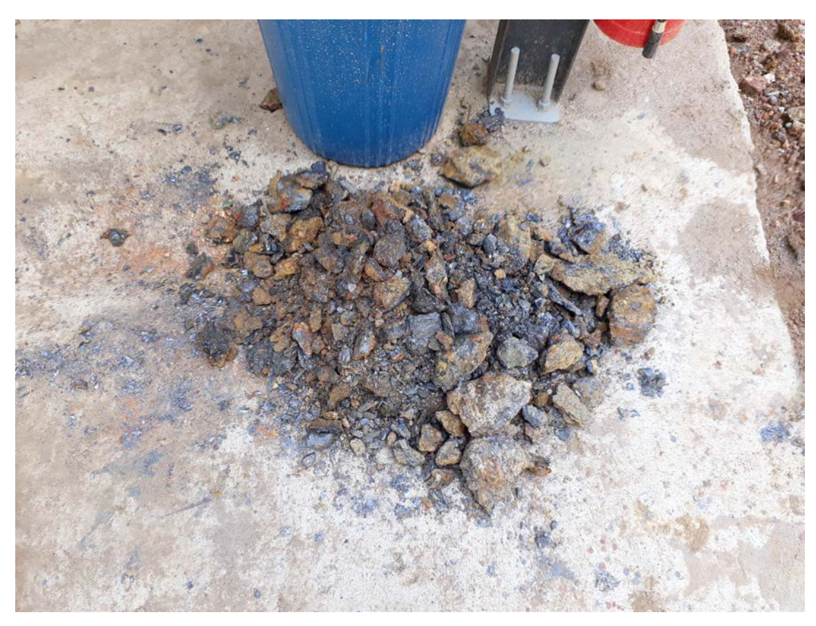
Figure 4: Weathered vein graphite extracted from Shaft J as it is being sunk