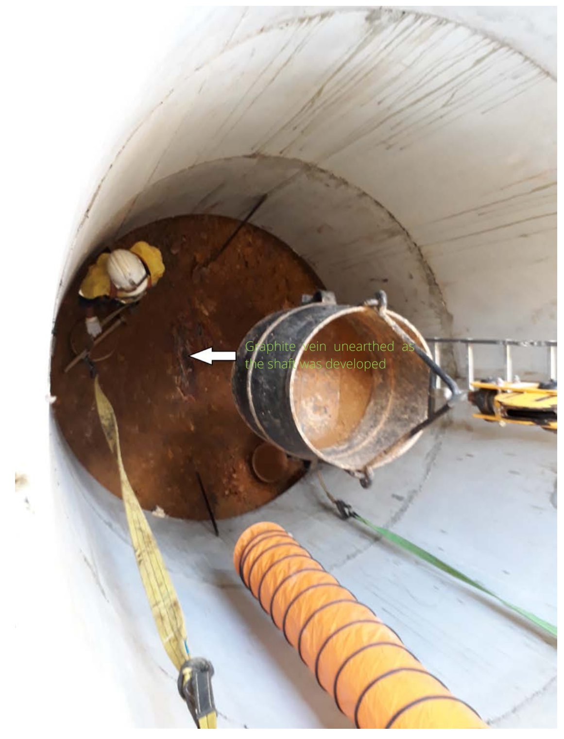
Figure 3: Shaft J 2.5 metres liner showing weathered graphite vein in shaft