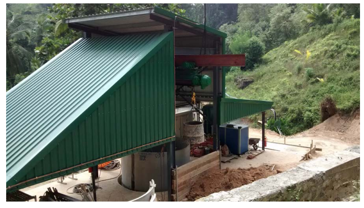
Figure 5: Shaft J site development area