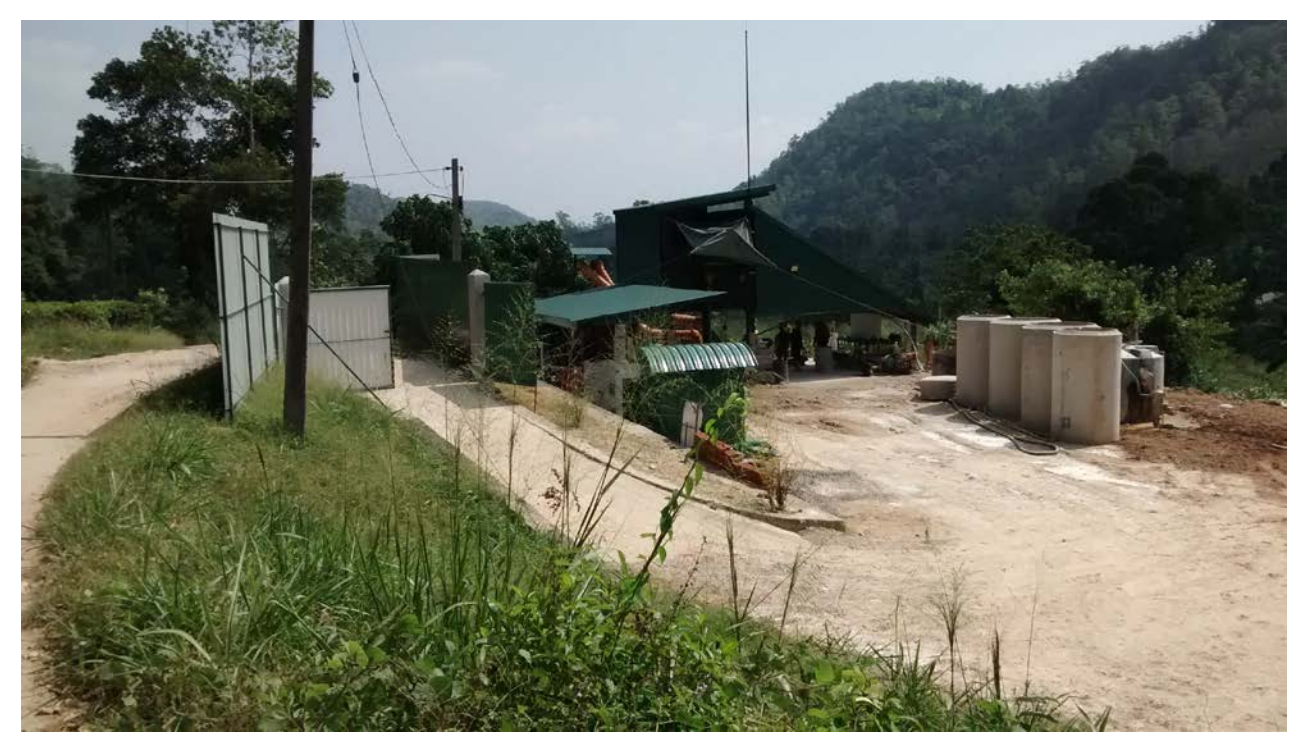
Figure 2: Shaft H site development area