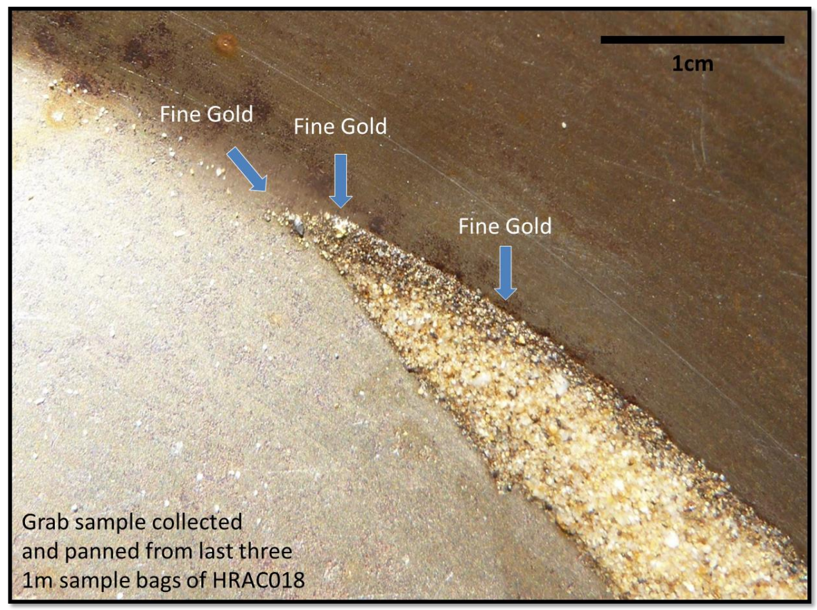
Figure 2: Photo of fine visible gold in panned material from the bottom of discovery hole HRAC018

Visible gold was panned from a grab sample of drill cuttings from the last 3 samples from HRAC018 (refer figure 2). These samples were dominated by increasing amounts of silica alteration, and quartz veining was also noted. The follow-up diamond hole at Battery Tank will twin this intercept and continue at depth to test the full thickness of mineralisation at this Prospect. Further drilling will be contemplated toward the end of the program, after the orientations and controls of the high-grade gold mineralisation are identified and confirmed.