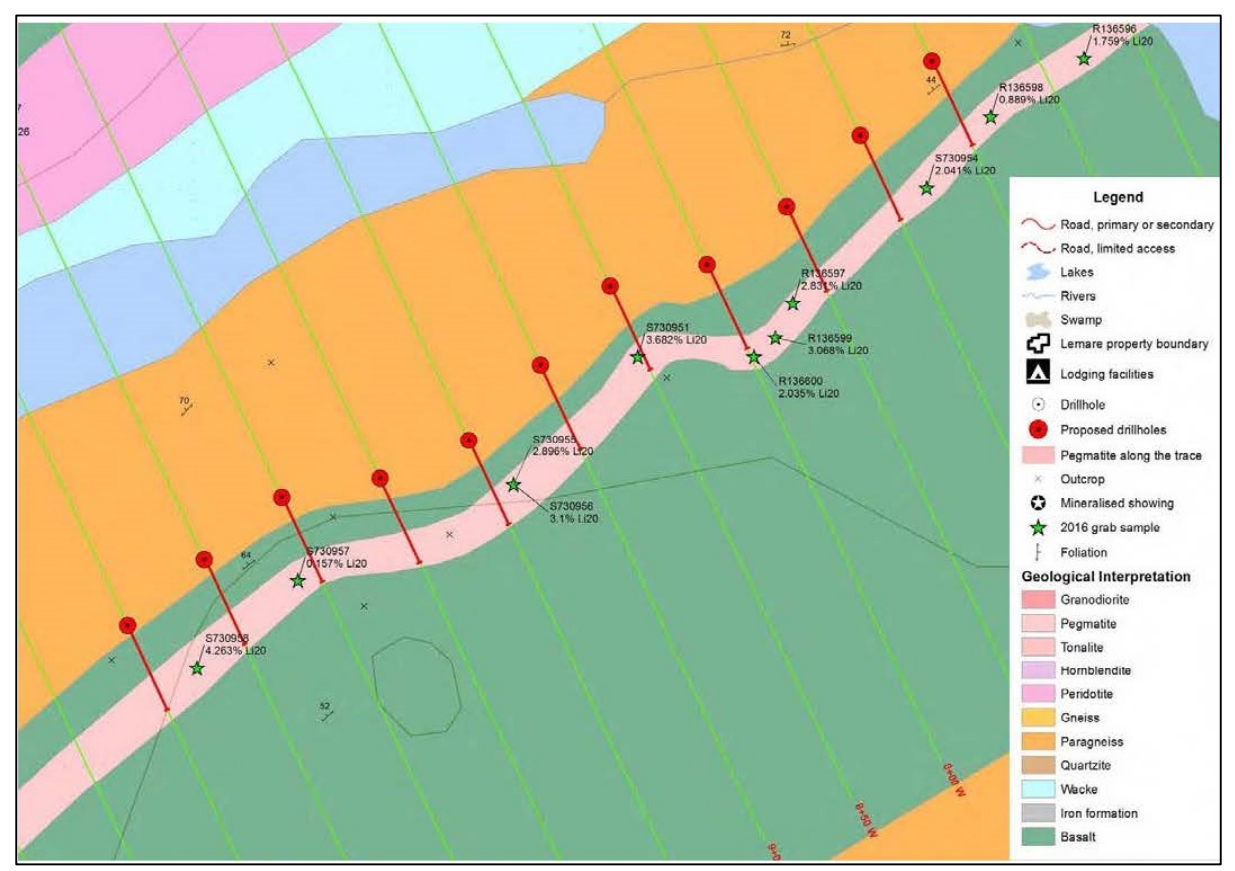
Figure 1. Location of planned holes for the drilling at Lemare SW on 50 m sections. Grab sample grades identified.

The drill program has been designed by project owner Critical Elements Corporation (TSX-V:CRE). Pegmatite outcrops that were flagged last season will be cleared of snow and shallow holes drilled to orientate subsequent deeper step out holes.