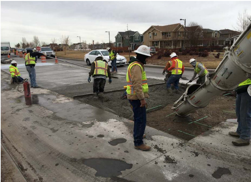
Figure 4. EdenCrete® Trial Slabs on Central Park Ave, Denver, Colorado.