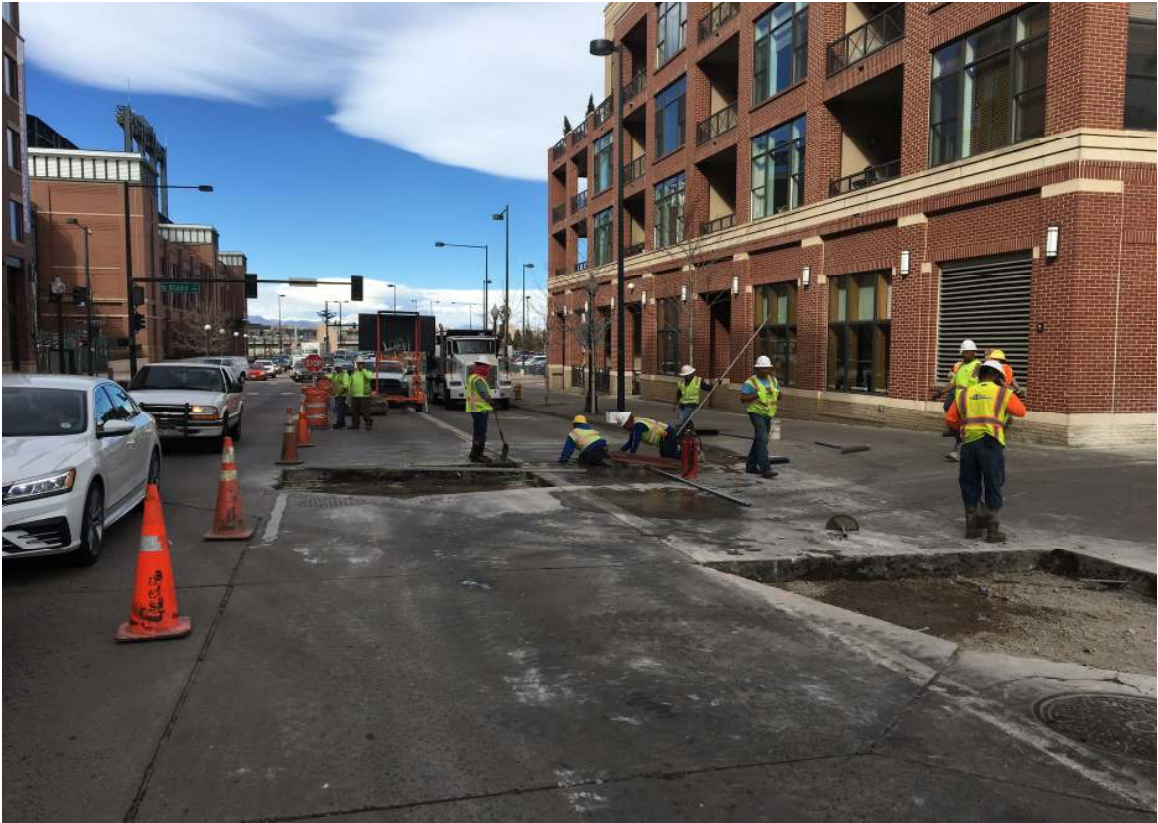
Figure 1. EdenCrete® Trial Slabs on 22 nd Street, Denver, Colorado.