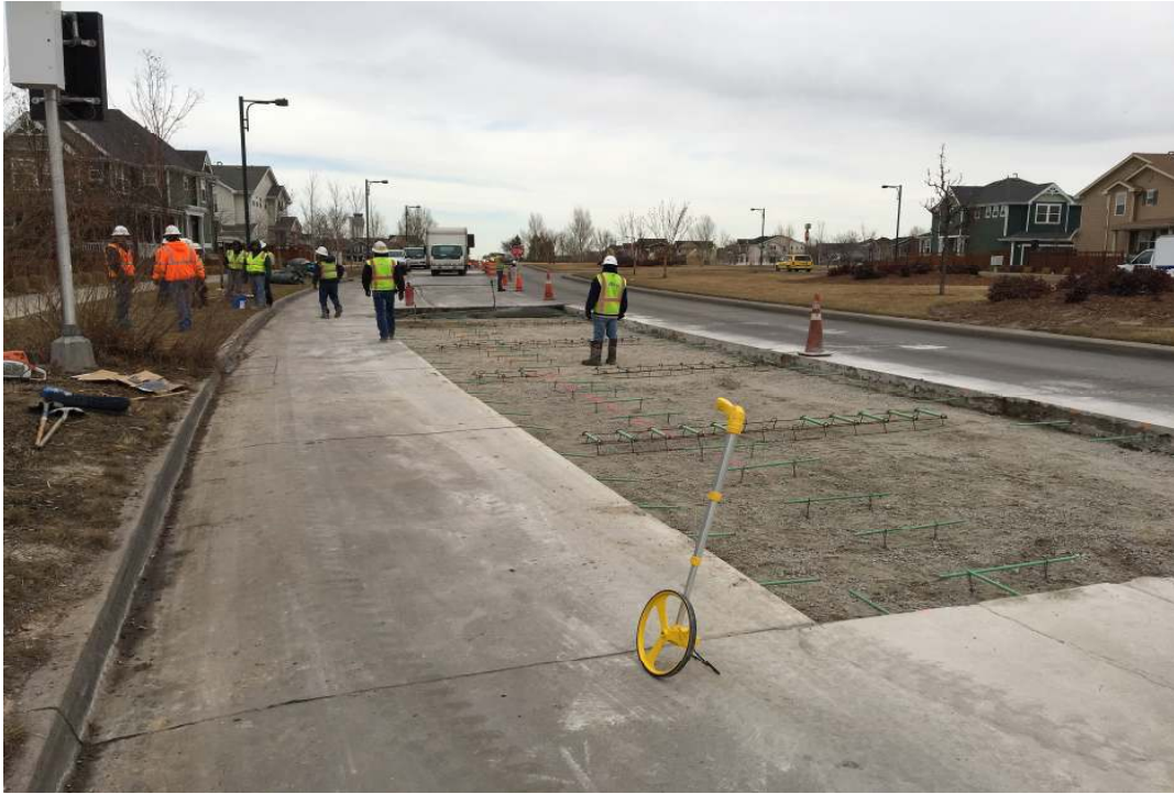
Figure 3. EdenCrete® Trial Slabs on Central Park Ave, Denver, Colorado.

The balance of the concrete was the same mix but contained no EdenCrete®.