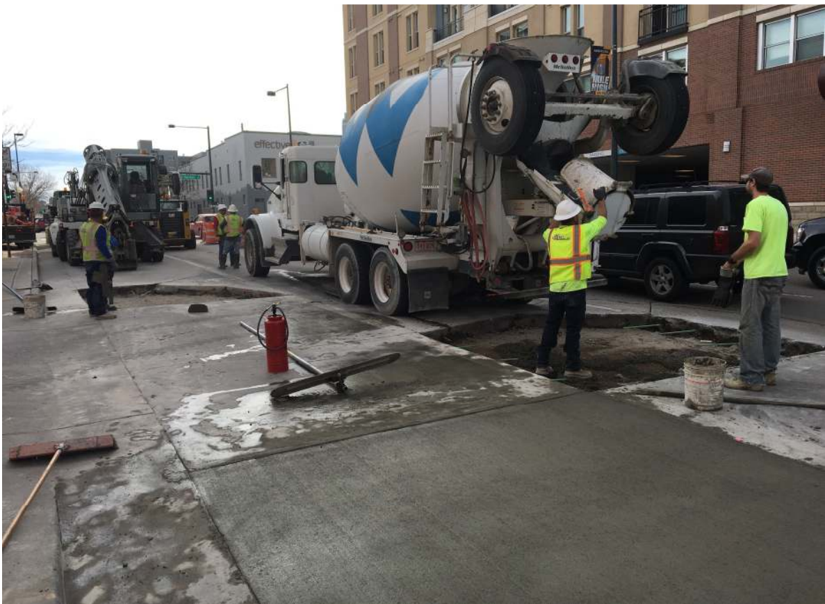
Figure 2. EdenCrete® Trial Slabs on 22 nd Street, Denver, Colorado.