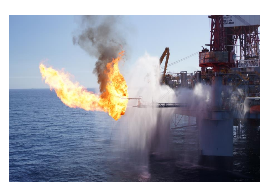
Successful flow test at Roc-2