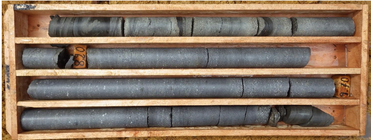
Figure 2: Zone of the historically named “DK3900” lens in hole DKDD005. Core in the picture is from approximately 8m below surface and strongly mineralised (sphalerite and galena).