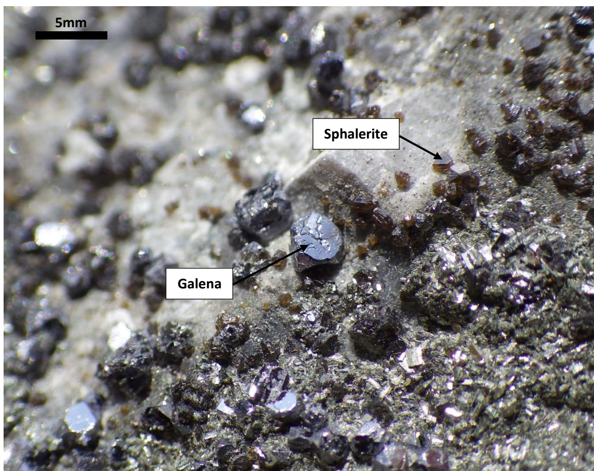
Figure 1: Very coarse, crystalline galena and sphalerite in a section of core from hole DKDD006.

A programme of stream sediment sampling is underway in order to define short term drill targets in the broader basin. Historic maps have indicated the presence of galena bearing rocks, at surface, up to 2km west of the interpreted basin margin. These historic observations suggest that a programme of detailed stream sediment sampling may unearth a significant, near surface, near term target and provide Trek with the opportunity to take advantage of this relatively cheap, relatively quick method of simple exploration.