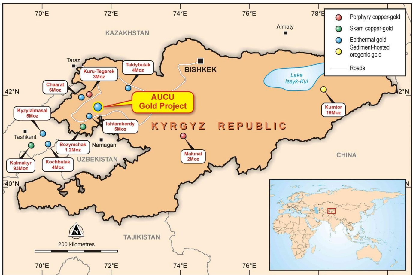
Location Map: Northwest Kyrgyz Republic, Central Asia