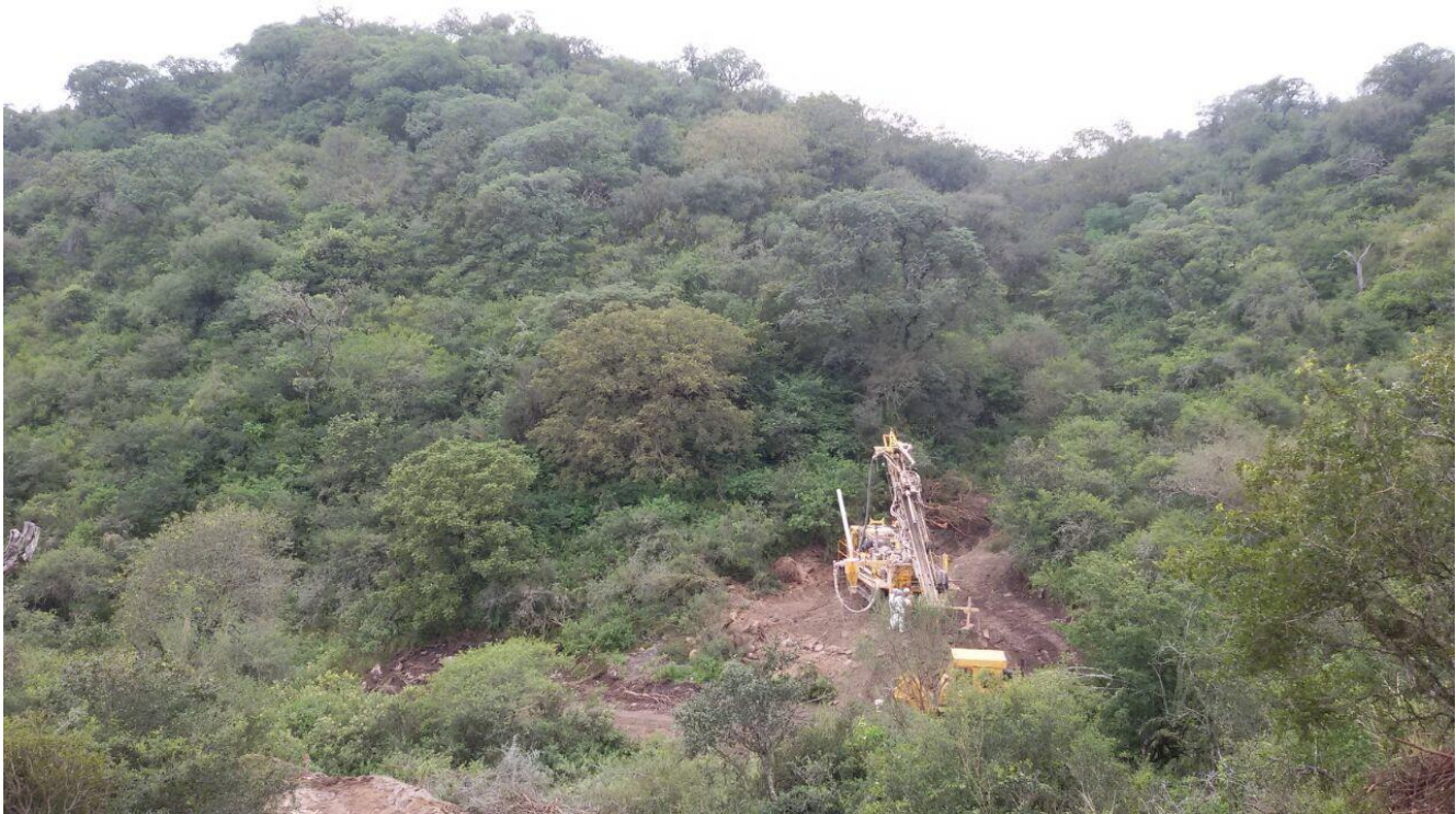
Figure 1. Drilling at Campo el Abra