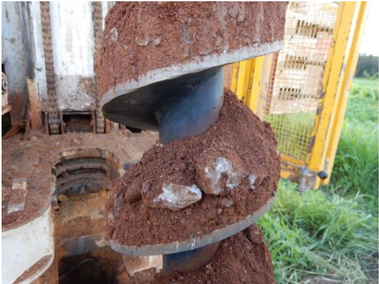
Figure 3. Auger Drilling on Montepuez Ruby Project, February 2017