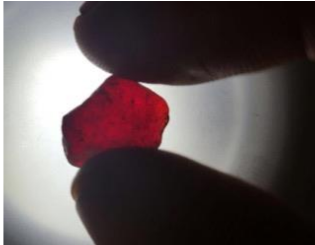
Figure 2. Some of the Mustang Special Stones included in second parcel

A number of the five special stones being cut by award-winning gem-cutter Meg Berry at her facilities in San Diego, California are scheduled for completion by end of March 2017 following which they will be sold to customers in the USA.