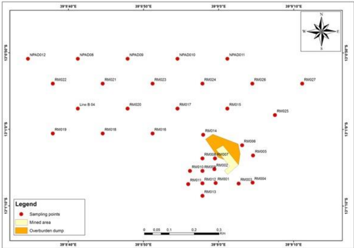
Figure 4. Location map of auger drilling boreholes surrounding Pit 21. Further planned auger holes are shown in Figure 6.