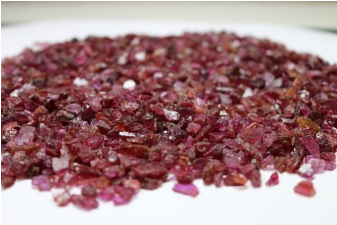
Figure 1. Portion of the Mustang Gem-Ruby Inventory.