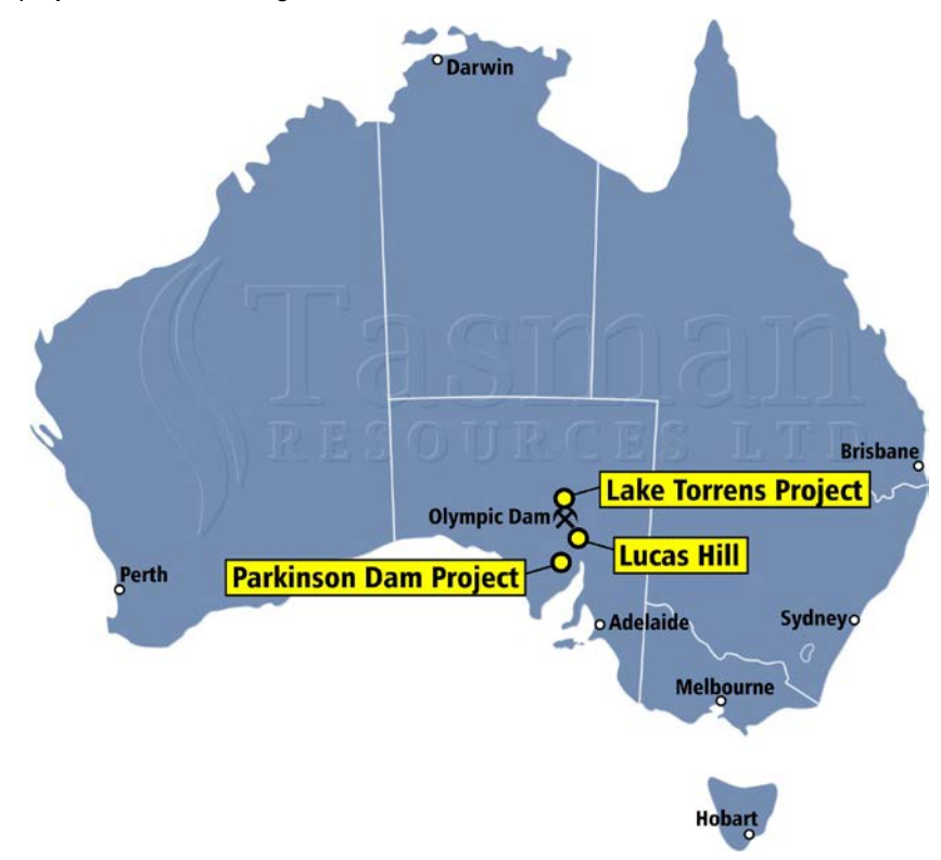
Figure 2: Location of Tasman Project Areas in South Australia

No other significant exploration activity occurred on Tasman's projects during the six months. The location of all Tasman's exploration projects is shown in Figure 2.