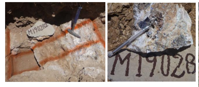
Figure 1: ABOVE Channel sampling at Humaspunco East LEFT The sample is marked out perpendicularly across the vein. MIDDLE The sample is taken and numbered. RIGHT Sample with coarse galena (lead sulphide) and sphalerite (zinc sulphide) and smithsonite (zinc carbonate) with calcite and barite as gangue material.

Inca Minerals Limited (Inca or the Company) (ASX code: ICG) has made further important discoveries during the recently resumed detailed mapping and systematic sampling program (DMASS or Program) at the Company's Riqueza Project. Additional mineralised EW and NS veins, extensions of known mineralised EW and NS veins and additional breccias have all been uncovered in the latest phase of the DMASS. As stated in previous reports, the intention of the Program is to map and sample the pre-Inca veins (namely HV1-HV10) that mainly occur at Humaspunco East. However, the Program is also yielding rich new forms of mineralisation. Without hindering or delaying upcoming drilling, the DMASS Program will now be extended to other parts of Humaspunco Hill.