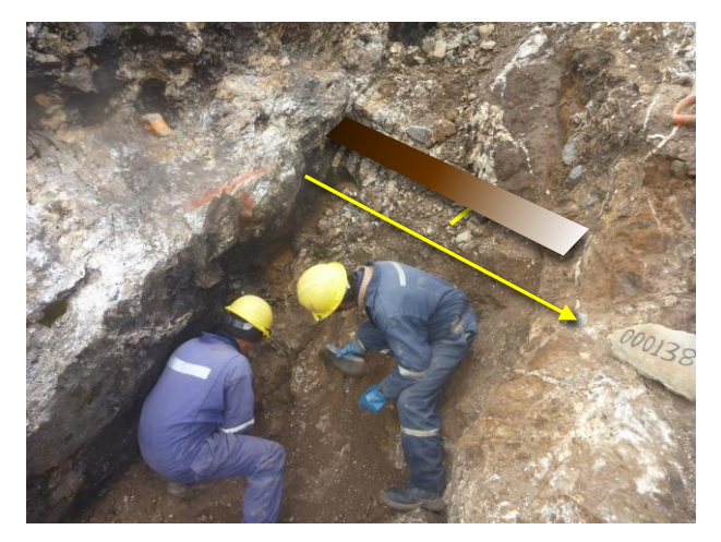
Figure 3 LEFT A large vein, over two metres wide, is being prepared for sampling. The sulphides that occur within the vein appear to concentrate towards the hanging wall (left hand margin). This is seen by the gradual increase in brown colouring (oxidised and semi-gossanous sulphides) to the left across the vein. The vein also hosts large masses and veins of barite (cream colouring).