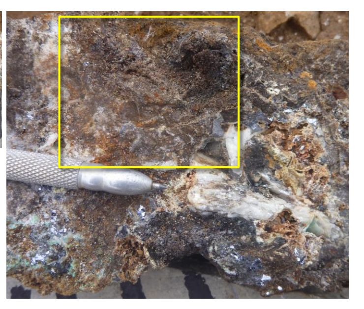
Figure 2: ABOVE Another example of channel sampling at Humaspunco East. The sample RIGHT is particularly rich in sphalerite (highlighted area).

Recent mapping has also resulted in extensions of veins HV11 and HV12. HV11 is a 200m long vein that doglegs from north to north-east (Figure 4). With several old workings along its course denoting past mining activity, this vein is one of a swarm of structures now believed to be part of a major fault system, possibly related to regional folding. This system is roughly perpendicular to the Callancocha Structure and has north block down normal-fault movement. HV12 now has a projected strike length of over 100m. It is believed to be one of several mineralised splay faults associated with the Callancocha Structure, which it parallels.