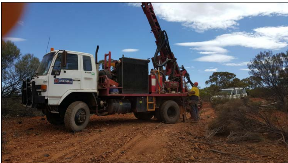
Figure 1 – RAB Drilling is being utilised to test key electromagnetic (EM) targets on the Sandstone Gold Project