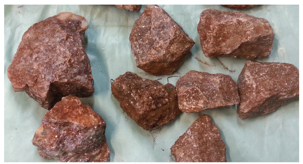
Photograph 1: Crushed Lepidolite mineralisation from the Pioneer Dome in preparation for the L-Max® test programme