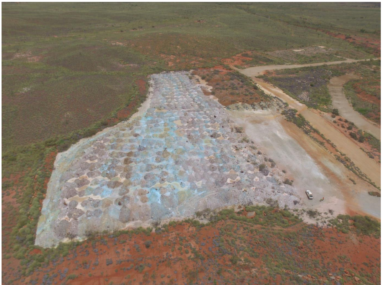
Figure 1: One of the stockpiles of Copper Oxide ore at Whundo containing +50,000 tonnes grading 1.5% Cu.

Historically the Whundo Copper Mine only focused on the mining of copper sulphides. Near surface oxides (surface to 25m-30m depth) were not processed at Radio Hill as they were not suitable as plant feed.