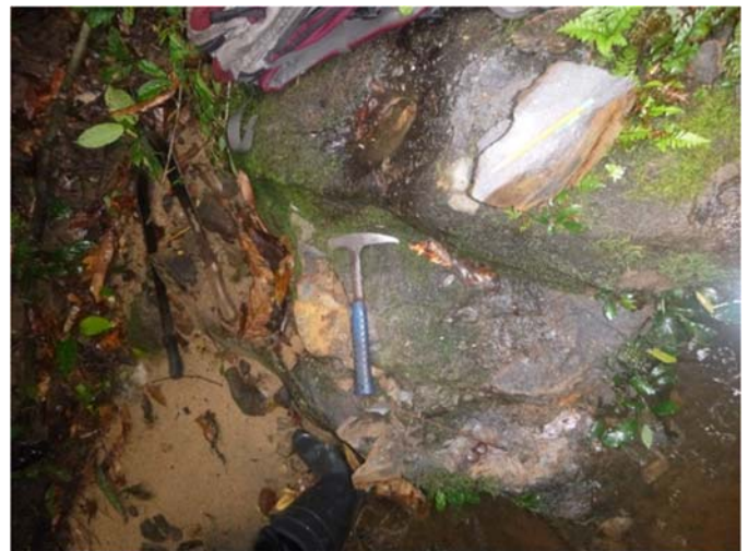
Figure 4: This outcrop from the Nimadbimbou Prospect, approximately 15km to the south of Dikaki returned an assay of 14.0% combined Zn+Pb (sample MKR342).