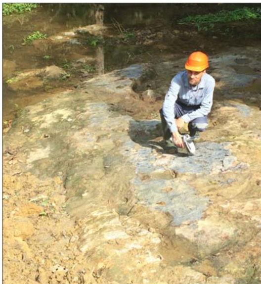
Figure 3: This entire outcrop within the Dikaki embayment contains approximately 20 – 40 % Galena and Sphalerite (Lead and zinc sulphide minerals respectively).

The prospects that occur along the contact provide a window into the broader Cotier Basin and indicate the prospectivity of the entire region. With these new results continuing to confirm high grade base metal mineralisation away from the more explored prospects, the entire basin margin becomes a live target. This would suggest that the sediments within the basin itself are also highly prospective.