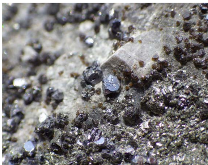
Figure 1: Very coarse, crystalline galena and sphalerite in a section of core from hole DKDD001

Mineralisation is comprised largely of fine grained sphalerite and galena in varying concentrations within bands with occasional solid veins. There are also coarse grained crystalline examples of both minerals.