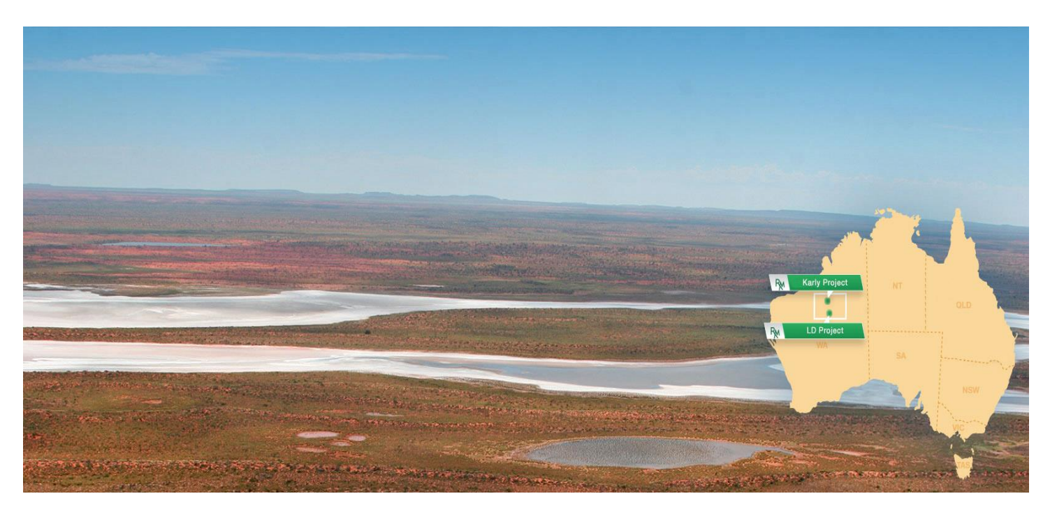
Figure 1: Location of Reward's LD and Dora SOP Projects