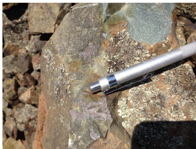
Figure 2. Historical cobalt workings (left; with geologist for scale) and Cobaltite- Erythrite mineralisation (silver-pink) in sediment manto from workings (hornfels).