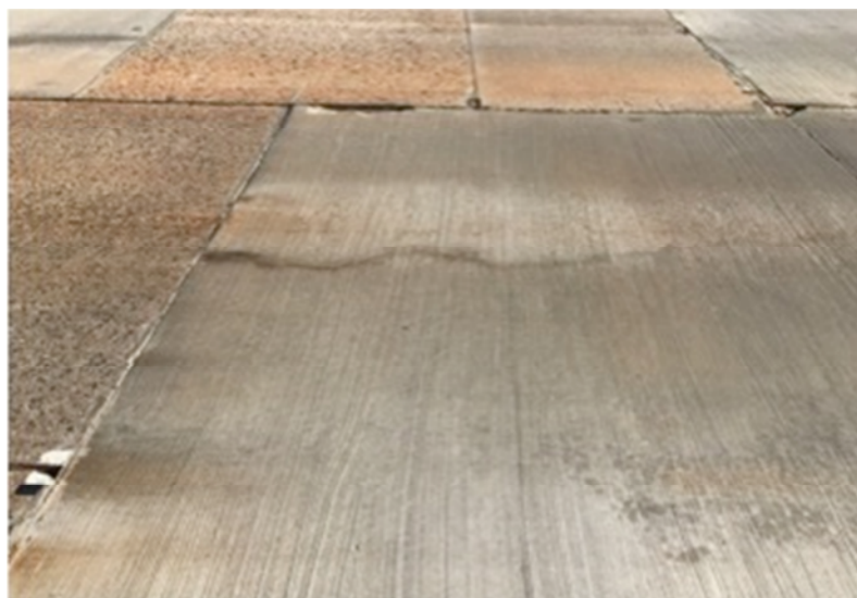
Figure 2. Second Reference Slab after 14 months (Oct 2016) - crack to full depth of slab.