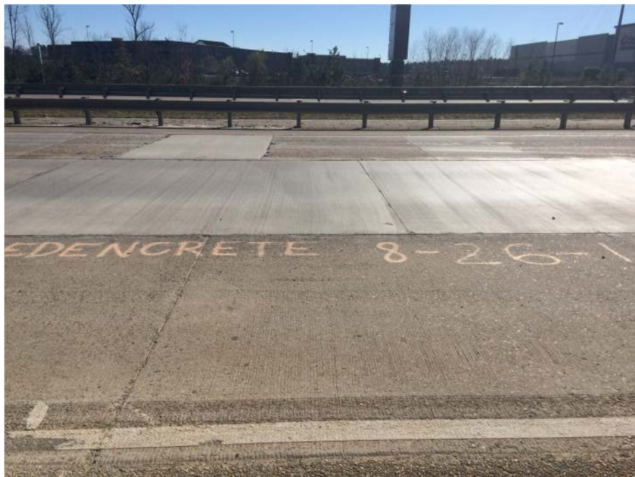
Figure 4 - Second EdenCrete® Slab after 18 months (19 Jan 2017) - showing a superficial crack.