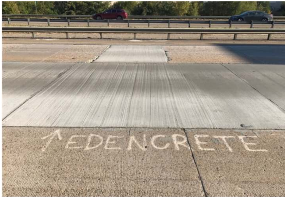
Figure 3. Second EdenCrete® Slab after 14 months (Oct 2016) - showing no cracking.