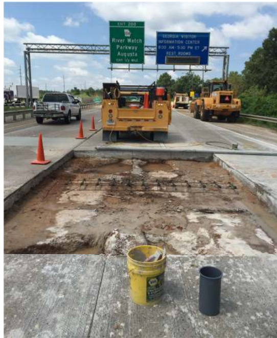
Figure 1. First Trial - Difficult Sub-soil Conditions and Inadequate Sub-surface Preparation.