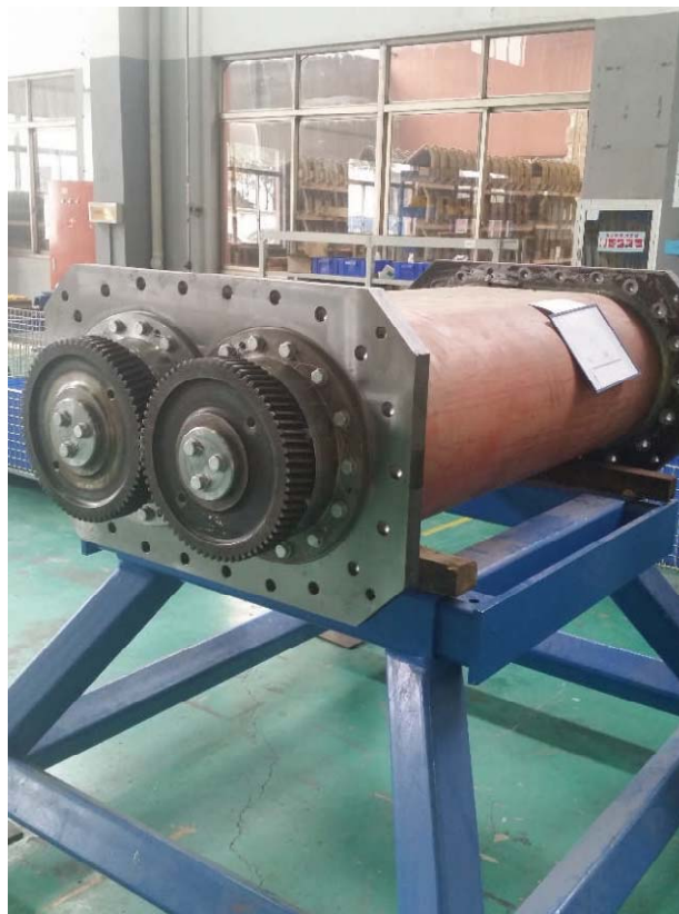
Figure 4 – Grizzly Vibrating Mechanism Assembly

Of the forty (40) packages that comprise all of the machinery and equipment necessary to build the process plant, contracts have been signed on twenty five (25) of the packages, with the remaining fifteen (15) all in advanced stages of negotiation. Packages have been let in order of priority relating to the lead times of each piece of equipment so that the aggressive development schedule set by the Company can be maintained.