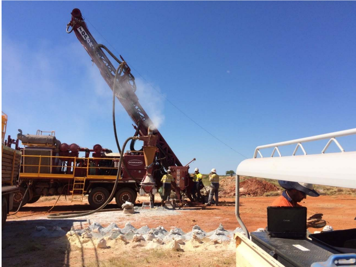
Fig 3 – RC Drill Rig onsite at Mallina