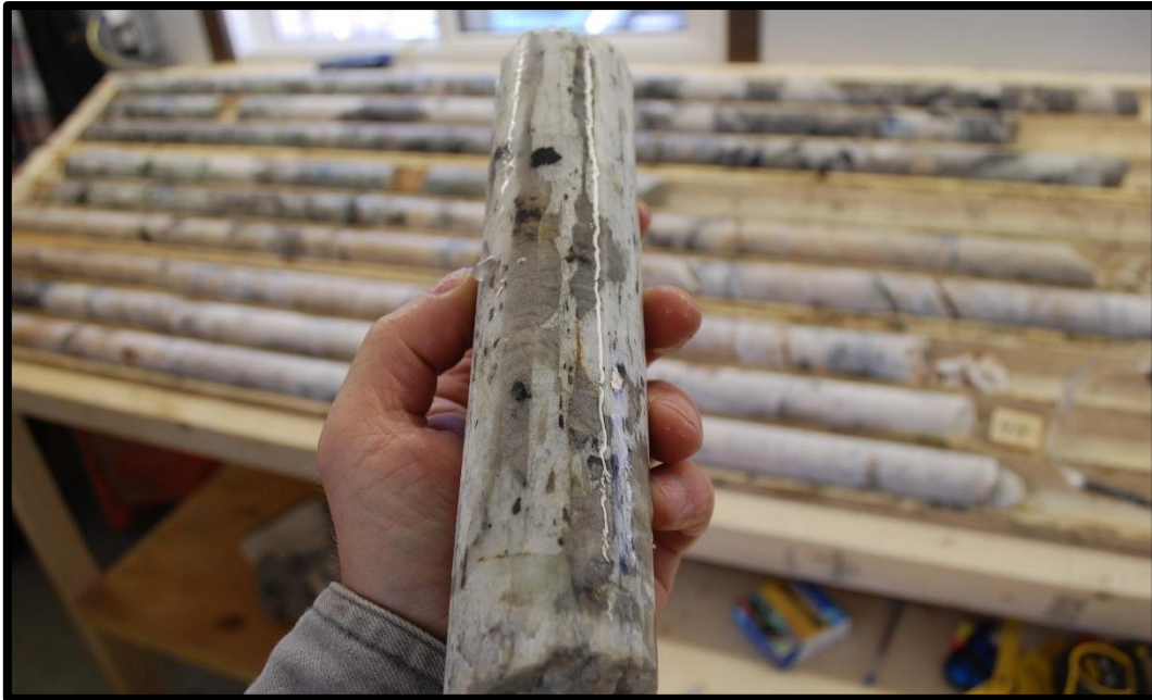
Figure 1. Drill core showing large Spodumene crystals from SL-17-22.

The drilling has continued to validate the known primary mineralised zones, further defining the boundaries of the main outcropping area and extensions of the secondary spodumene-bearing pegmatites at the project. Once the drill core has been logged, cut and prepared, the drill samples will be sent to Activation Laboratories in Thunder Bay for assay.