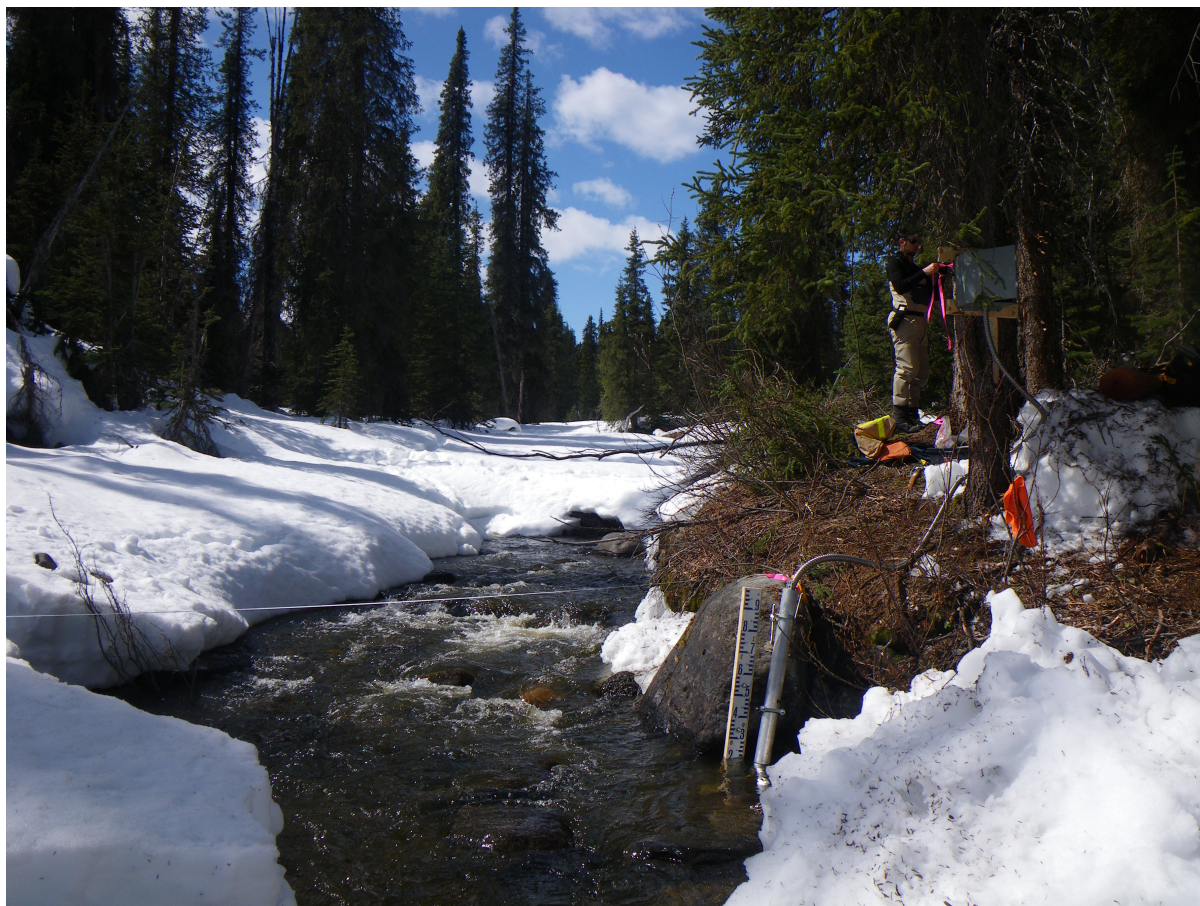
Figure 2: Freshet monitoring site at Groundhog North, May 2017