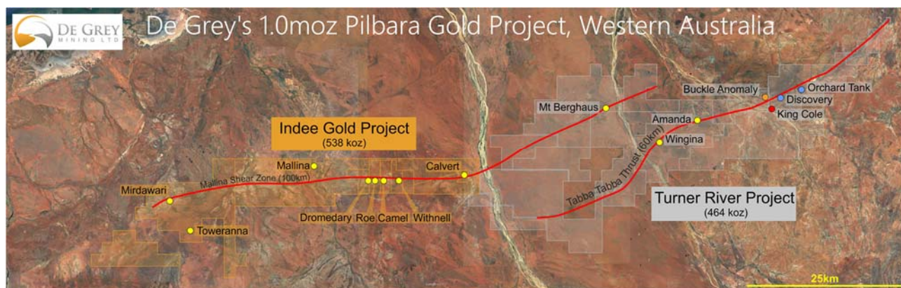
Figure 1 Pilbara Gold Project, showing prospect locations.