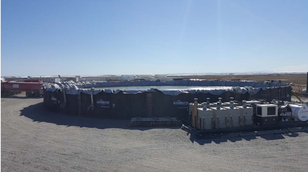
Fig.1 Stimulation Water Reservoir on Location at Franklin Bluffs