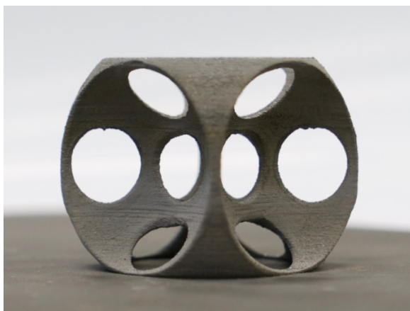
Geometric Shape in CP-Ti