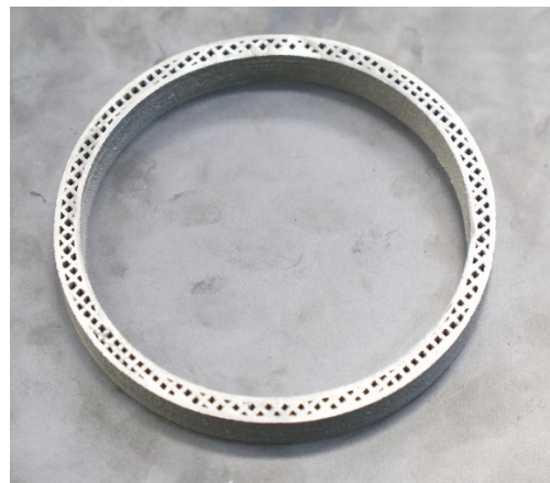
Ring with mass reducing hatch in NiSiB

Aurora continues to make good progress in expanding and streamlining production with the hiring of new staff and improved systems in place. Ongoing product improvement is continuing with increased print resolution and a simultaneous broadening of materials being printed, including metal alloys such as 304 SS (stainless steel), bronze, NiSiB (nickel, silicon boron) and CoCr (cobalt, chromium).