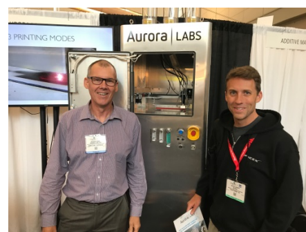
Rapid + TCT Exhibition, Pittsburgh 2017

Aurora participated in the Rapid+TCT expo and convention in Pittsburgh , Pennsylvania, USA, in May. The show was very successful and generated a number of sales enquiries as well as significant contacts for product and service development. The Company is exploring these opportunities to improve its products and/or speed development and delivery of the MFP and LFP to market.