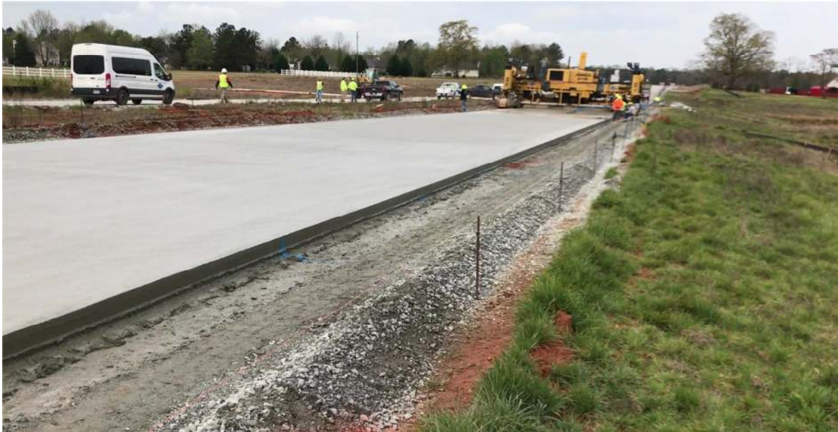
Figure 2. Completed section of new highway with added EdenCrete

As previously announced ( ASX: EDE 30 March 2017 ), a further Field Trial by GDOT of EdenCrete® is currently underway on a State highway in Comer County, Georgia ( see Figure 2 below ) in concrete that is used in new concrete road construction (GDOT Specification Section 430 and/or 439)(concrete Classes 1, 2 and 3,) and for whitetopping (GDOT Specification Section 453), or replacing the surface of an asphalt pavement with a concrete surface layer. It is anticipated that the section of road where the trial is being conducted will be monitored over a period of at least 12 months.