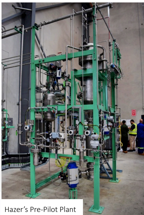
Hazer's Pre-Pilot Plant