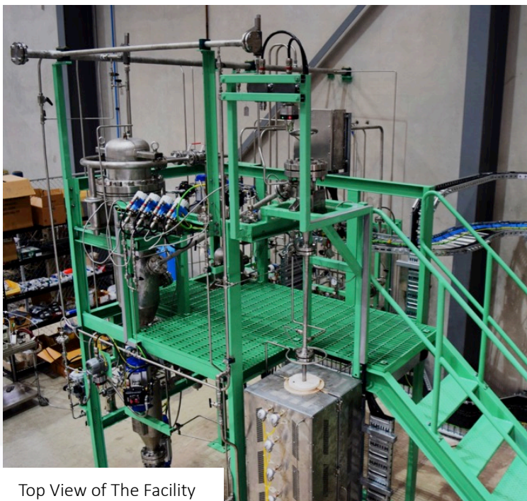
Top View of The Facility