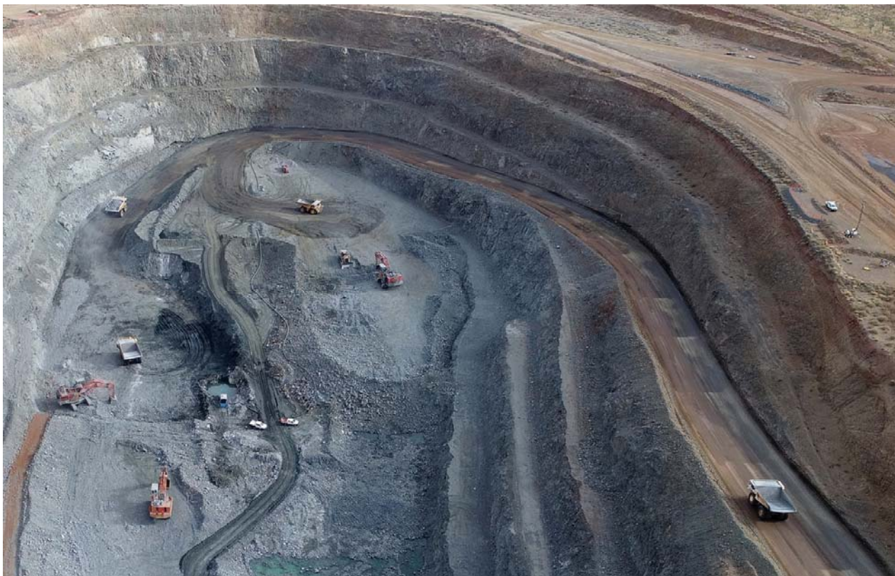
Figure 02: Drone photograph of the LM2 Pit, looking north-west, showing the remnants of the original LM1 starter pit all but gone.