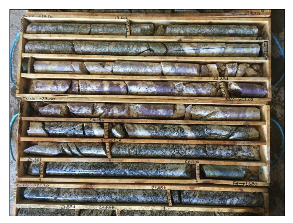
Figure 2. Alvarrões, Block 1, 3 meter thick un-weathered lepidolite-rich pegmatite sill, 21.0 m – 24.0 m, intersected in diamond drill hole ALVD05. Estimated 20% - 35% lepidolite (purple). Assays pending.