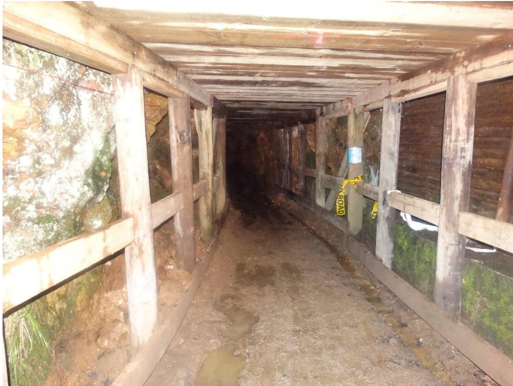
Completed portal support upgrades underground near mine entrance

Surface disturbances have been small and a silenced generator is being used while we investigate restoring mains power to the mine.