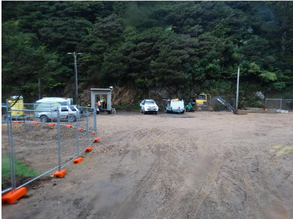
Development complete at surface with perimeter fencing

Surface disturbances have been small and a silenced generator is being used while we investigate restoring mains power to the mine.