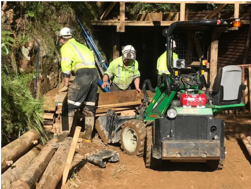
Talisman and Terra Firma team commencing portal entrance upgrades.