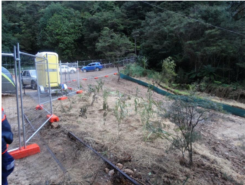
Silt Dam and Native plant nursery