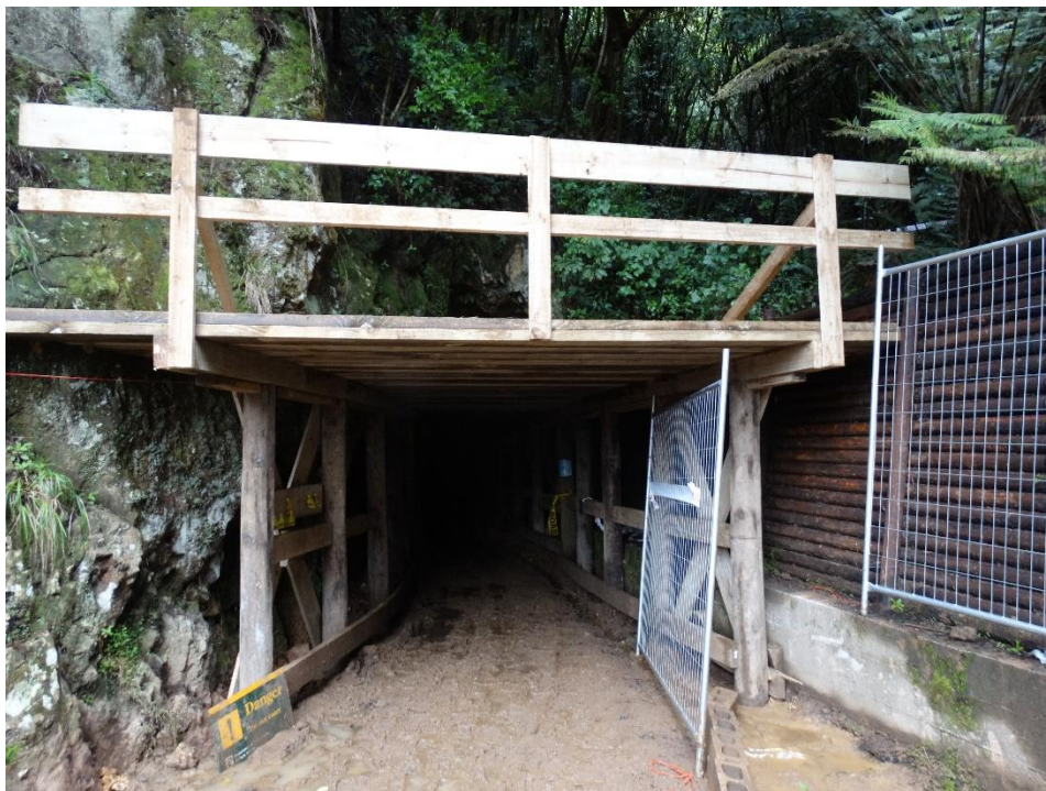
Portal entrance structure which will form part of the ventilation airlock