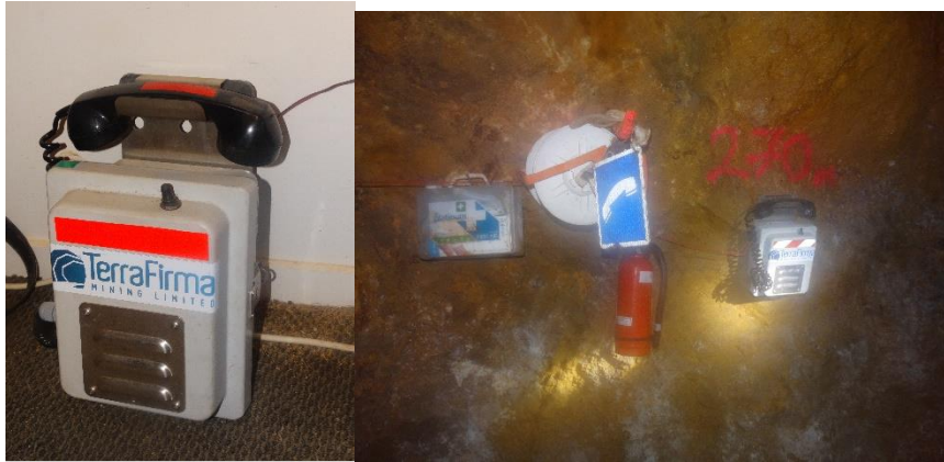
Communication system running from site underground

Terra Firma Mining Ltd an experienced local company has been engaged to provide civil engineering services to the project. The company's knowledge and experience operating in the local mining and underground construction sectors, coupled with a strong track record in health and safety management, will be of considerable value in the safe and efficient execution of the project.