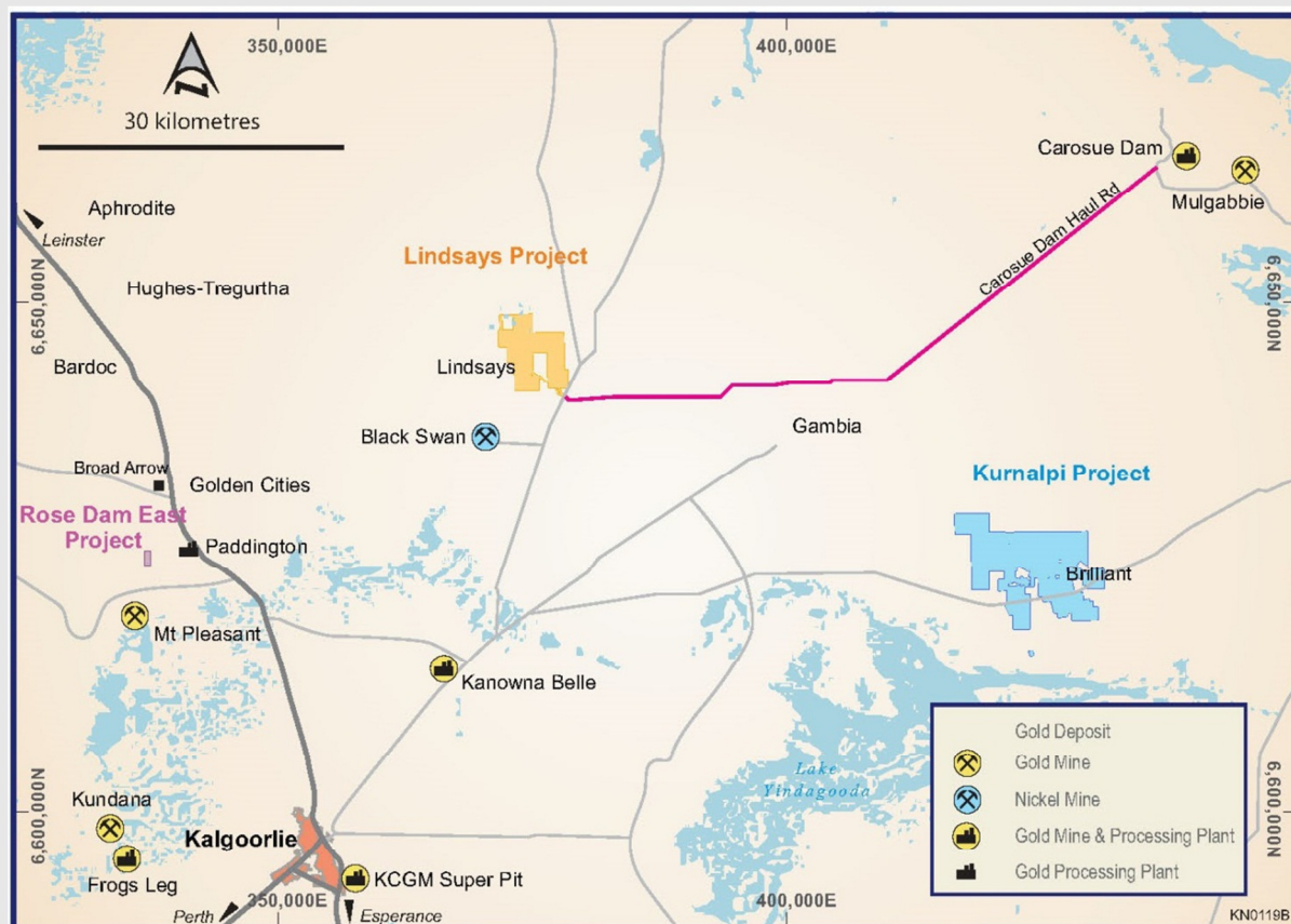
Location map of KalNorth projects showing roads and local processing plants