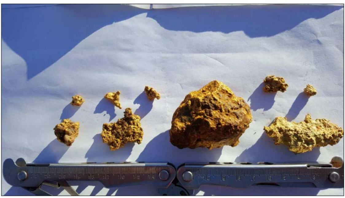
Figure 1. Some of the large gold nuggets recovered from Mertondale