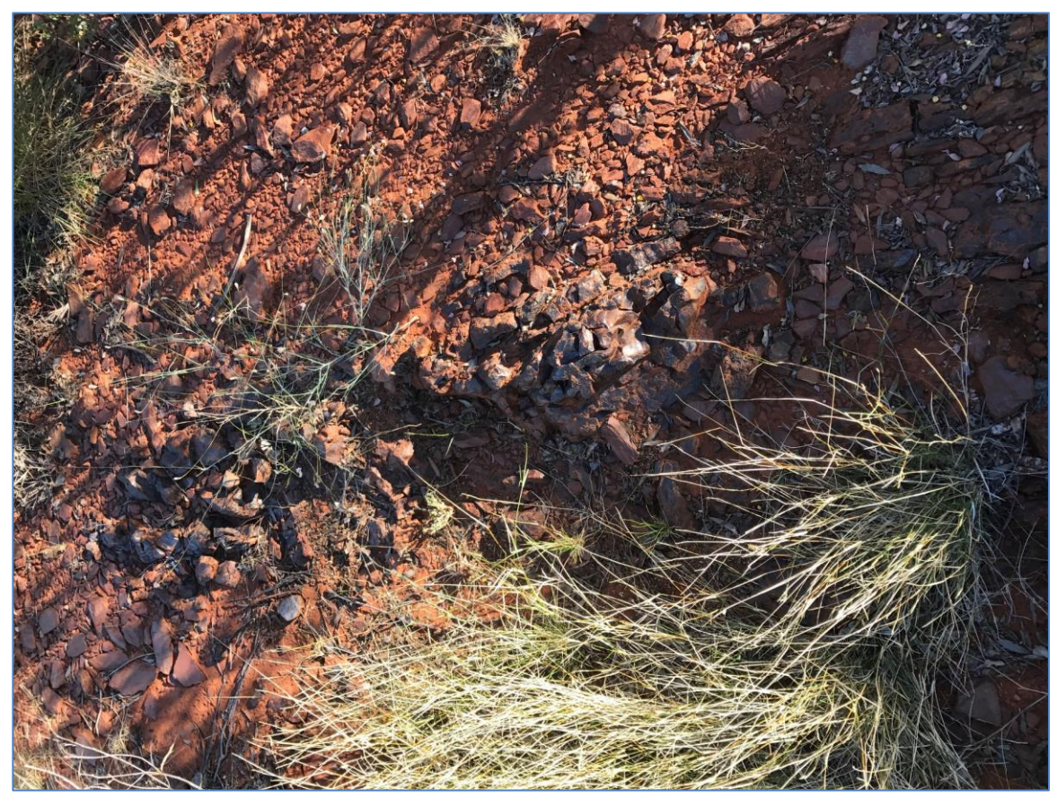
Figure 2: Photo of ferruginous gossan representing the outcrop of the Grapple Prospect mineralisation