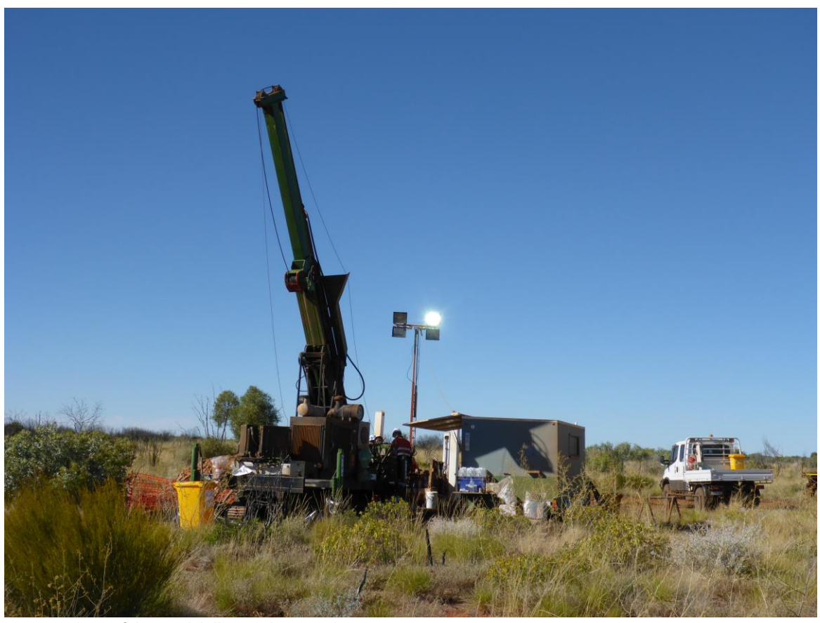
Figure 1: Photo of diamond drill rig at the Grapple Prospect