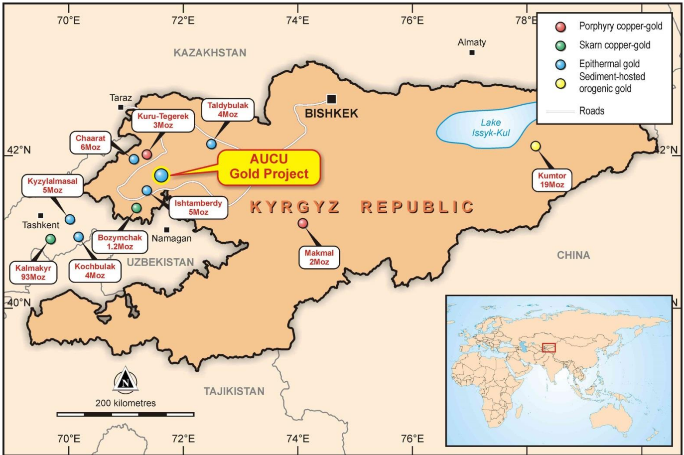
Location Map: Northwest Kyrgyz Republic, Central Asia