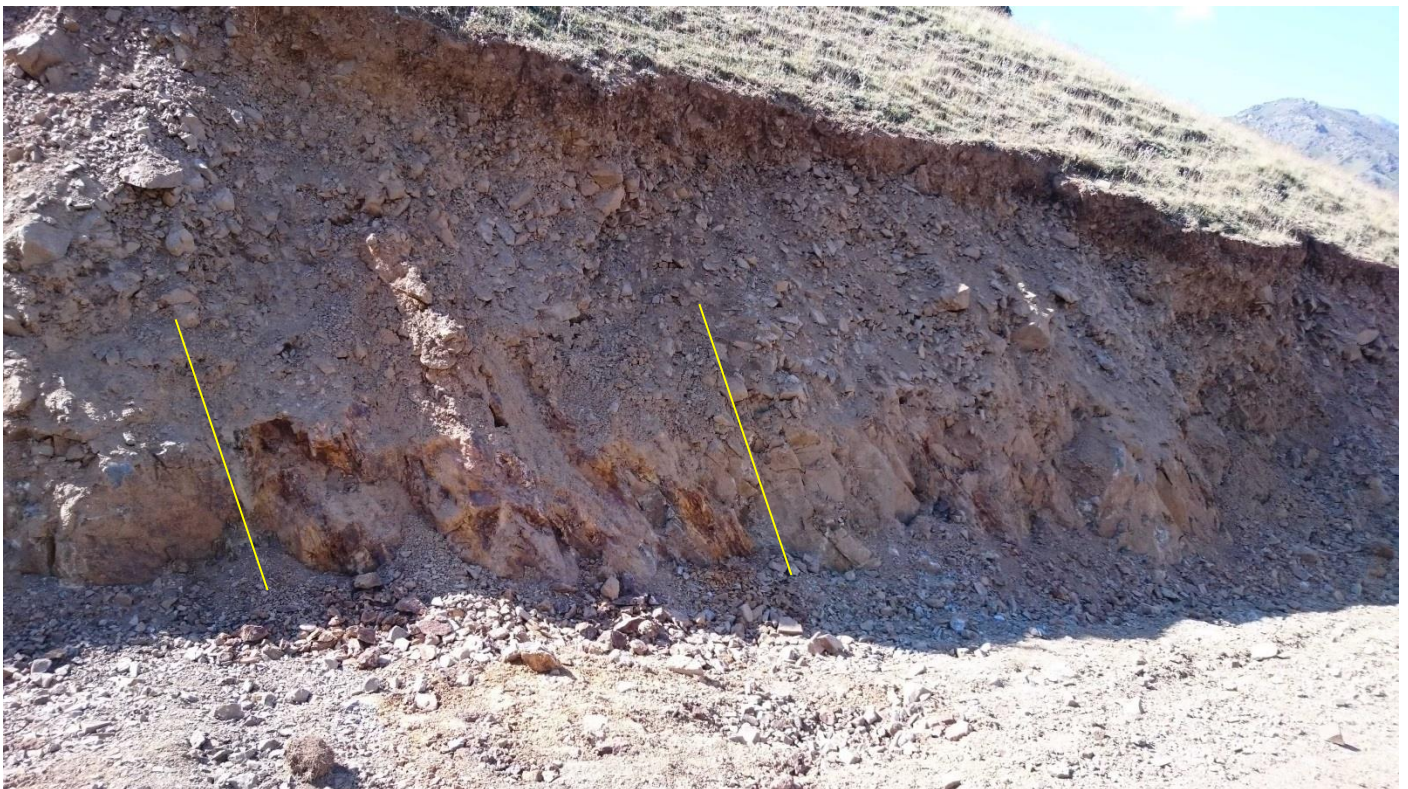
Figure 2: Newly discovered 4-metre wide outcropping mineralised zone adjacent to the Eastern Gold Zone. This zone has been identified in three bulldozer cuts spaced 50-60 metres apart covering 120 metres of strike length.