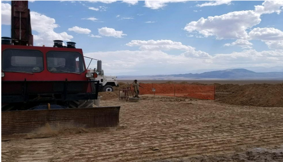
Figure 4: Site preparation being completed due to the soft ground at the Columbus Marsh Project.