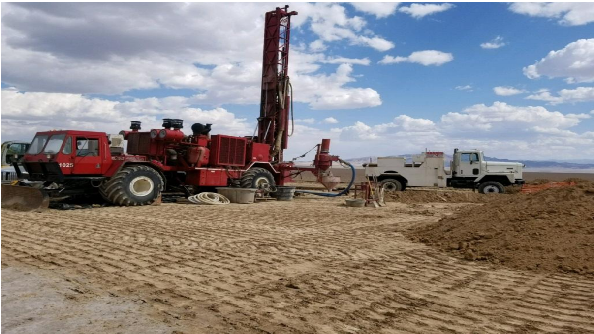
Figure 3: Drilling commenced at the Columbus Marsh Project