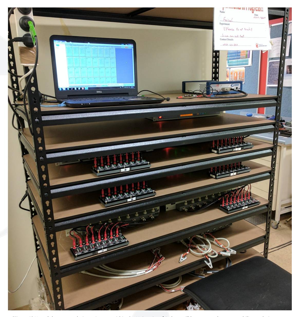
(Figure 3) Hazer's battery analysis equipment within the University of Sydney will leverage cycle rate capability analysis to compare the company's 99.95% synthetic graphite performance against various commercial types of graphite.

In collaboration with The University of Sydney, total discharge capacity, cycle rate capability and cycle life analysis will compare Hazers' 99.95% synthetic graphite performance against various commercial samples of graphite (including spherical coated natural graphite) concurrently assembled into reference coin cells.