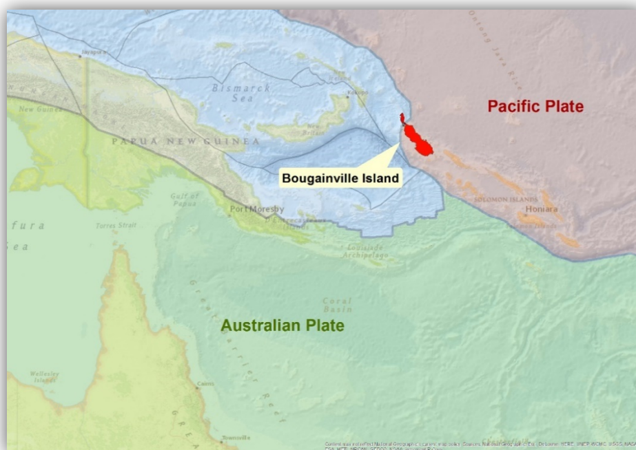
Figure 1: Bougainville location and tectonic setting

There have been several significant developments since GBX was granted the Kalia Option in March 2017. The moratorium on exploration and mining in place since 1971 was lifted and the President of the Autonomous Bougainville Government announced that applications for exploration licences would be accepted. Kalia lodged applications for the Tore project area on 19 June 2017. In September 2017, Kalia completed mining warden hearings in the Tore Project area.