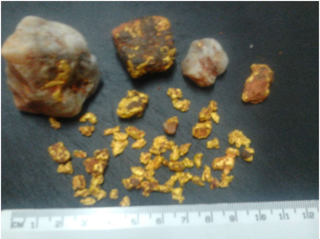
Figure 1. Some of the gold nuggets recovered from Hawks Nest