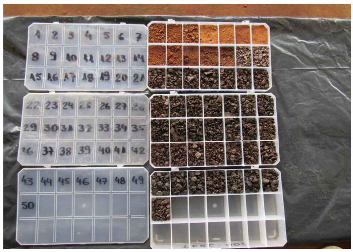
Fig. 2. One metre RC chip samples from hole TERC 02, showing fresh gabbro from 13m.

Due to the extended pre-leach period employed in BBX's assay technique and the logistics involved in transporting the samples over 3000 kms to Belo Horizonte and Rio de Janeiro for analysis initial results from Três Estados are not expected until late-October.