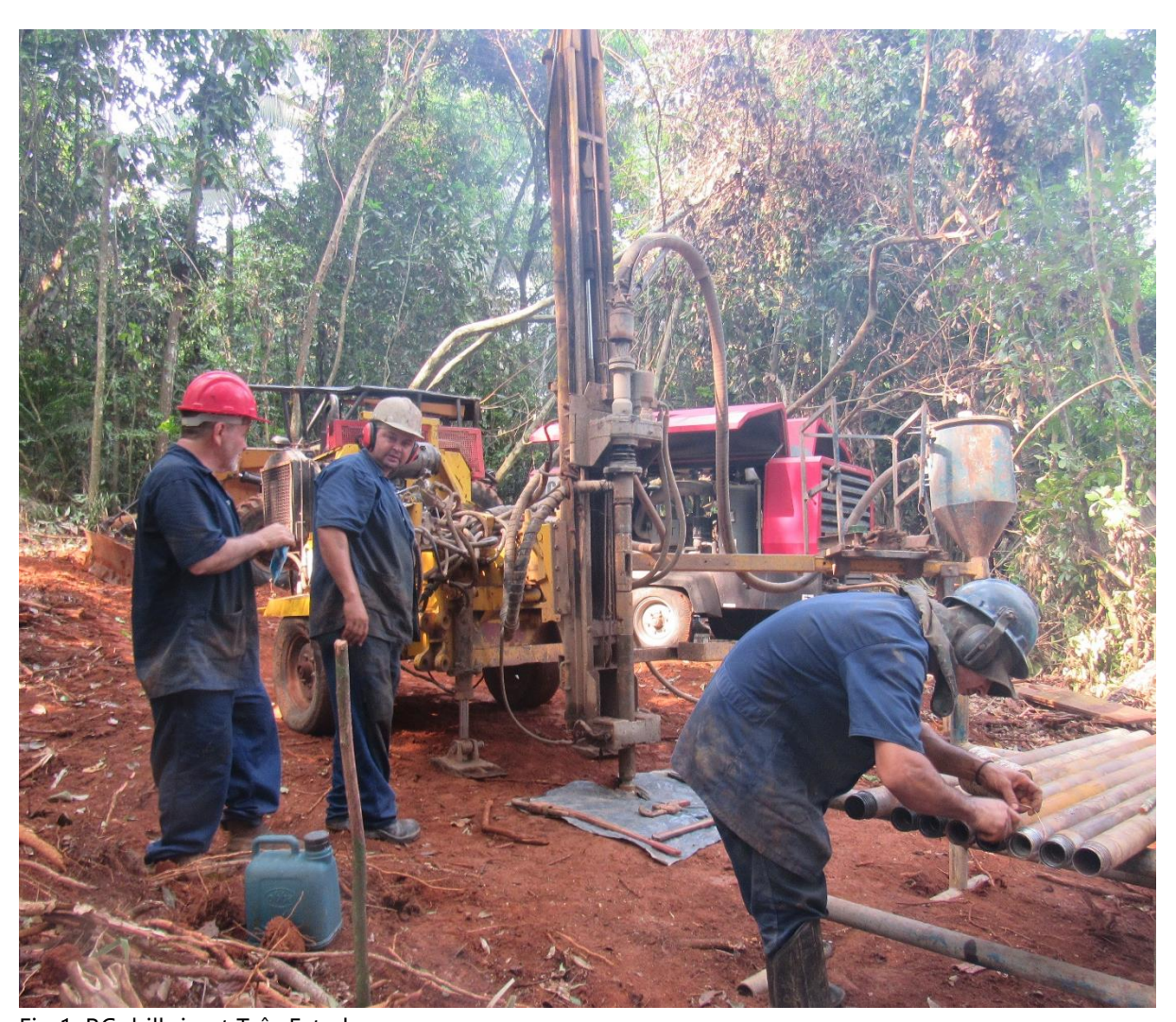
Fig 1. RC drill rig at Três Estados

BBX Minerals Ltd. ASX: BBX www.bbxminerals.com.au