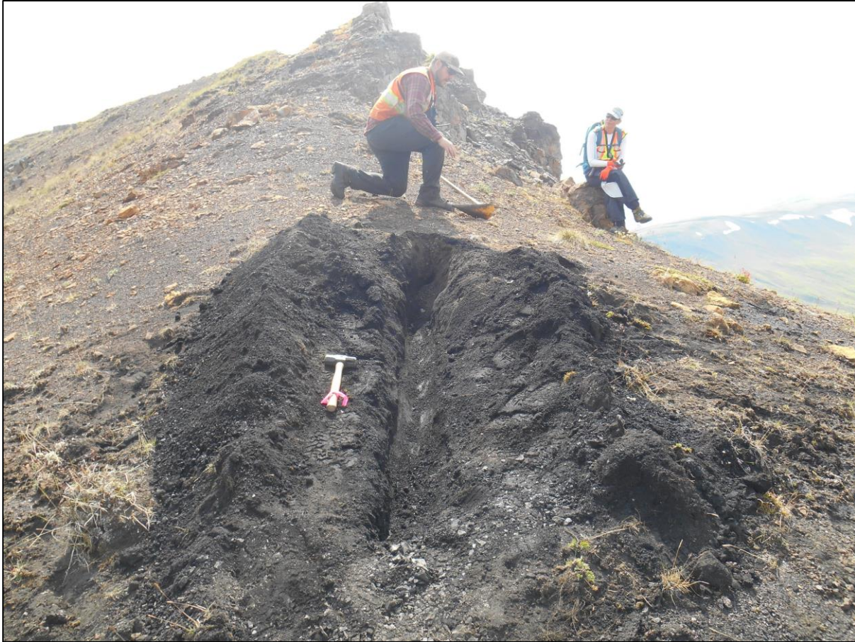
Figure 3: Panorama North 2017 Trench Location, TRPN-17-01