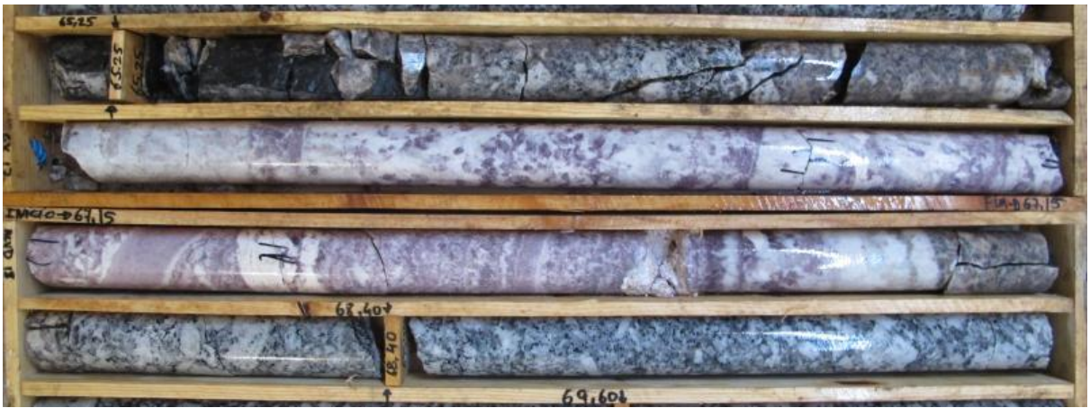
Figure 3. ALVD18, Sill O, Block 3, 1.87 m @ 1.21% Li 2 O from 66.17 m; 25% lepidolite (estimated).