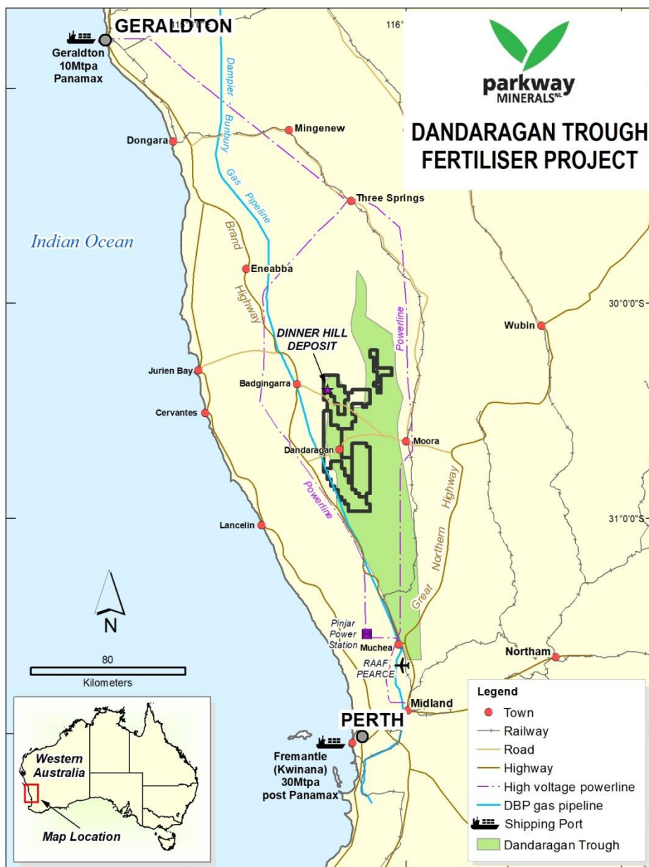
Figure 1 Location Plan – Dandaragan Trough Fertiliser Project

The project tenements cover two virtually horizontal greensand formations within the Cretaceous Coolyena Group: the Poison Hill Greensand and the Molecap Greensand. Over most of the area of the project they are separated by the Gingin Chalk and in places are underlain by a thin pebble horizon containing phosphatic nodules. An average thickness of about 11m of surficial, mostly sandy, cover overlies the greensand units. The greensands and the chalk contain significant amounts of phosphate as grains and nodules of fluorapatite. They also contain significant potash within the mineral glauconite.