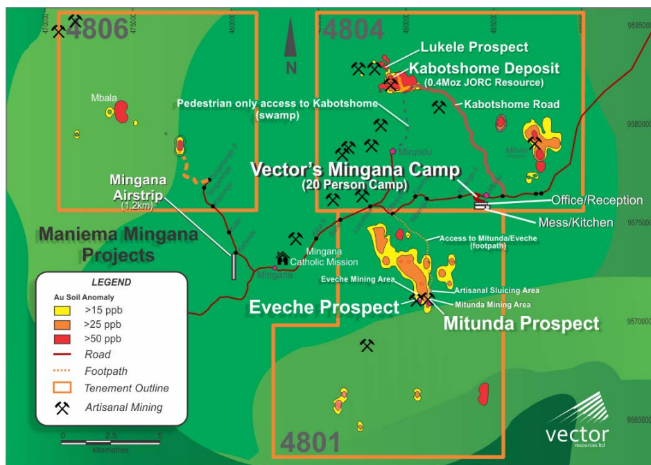
Figure 2: Location of the Lukele Gold Prospect on PR 4804 in relation to Vector's recently built exploration camp and other key gold prospects including the Mitunda and Eveche Gold Prospects on PR 4801

The Company's technical management believes the Lukele Gold Prospect to be an early stage discovery, which requires further detailed geological fieldwork, including mapping and sampling in order to improve the geological understanding and its relationship to the nearby Kabotshome Gold Prospect.