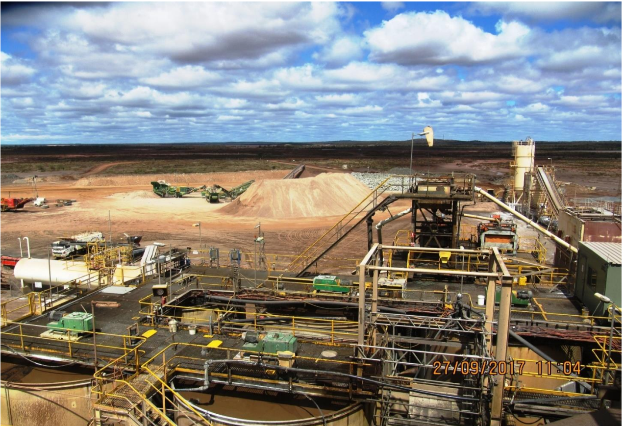
Figure 4 : Penny's Find crushed ore stockpile at the Lakewood Mill