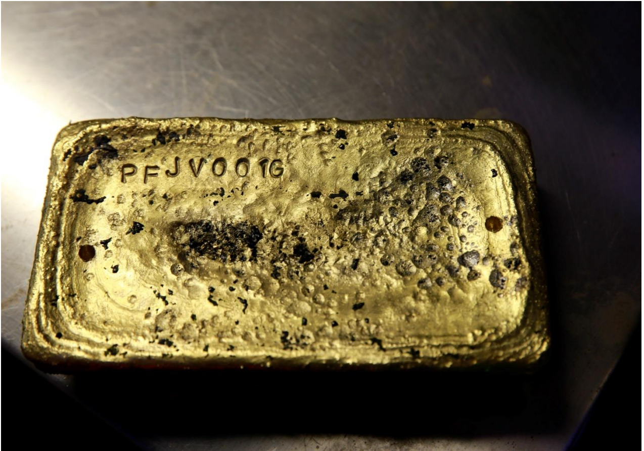
Figure 1 : First gold bar from Penny's Find