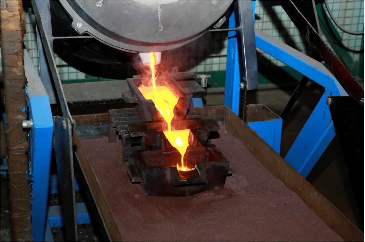
Figure 3 : Pouring of first gold bar