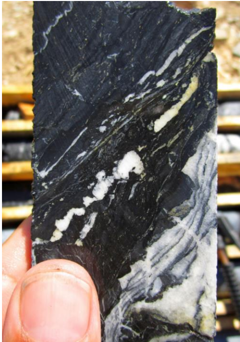
Photo of core from ALFP003 at 1203.0m

A strongly sheared and deformed black shale with intense quartz veining and 2-3% fine-grained disseminated chalcopyrite within the shales. Chalcopyrite also occurs as blebs and aggregates within the veins