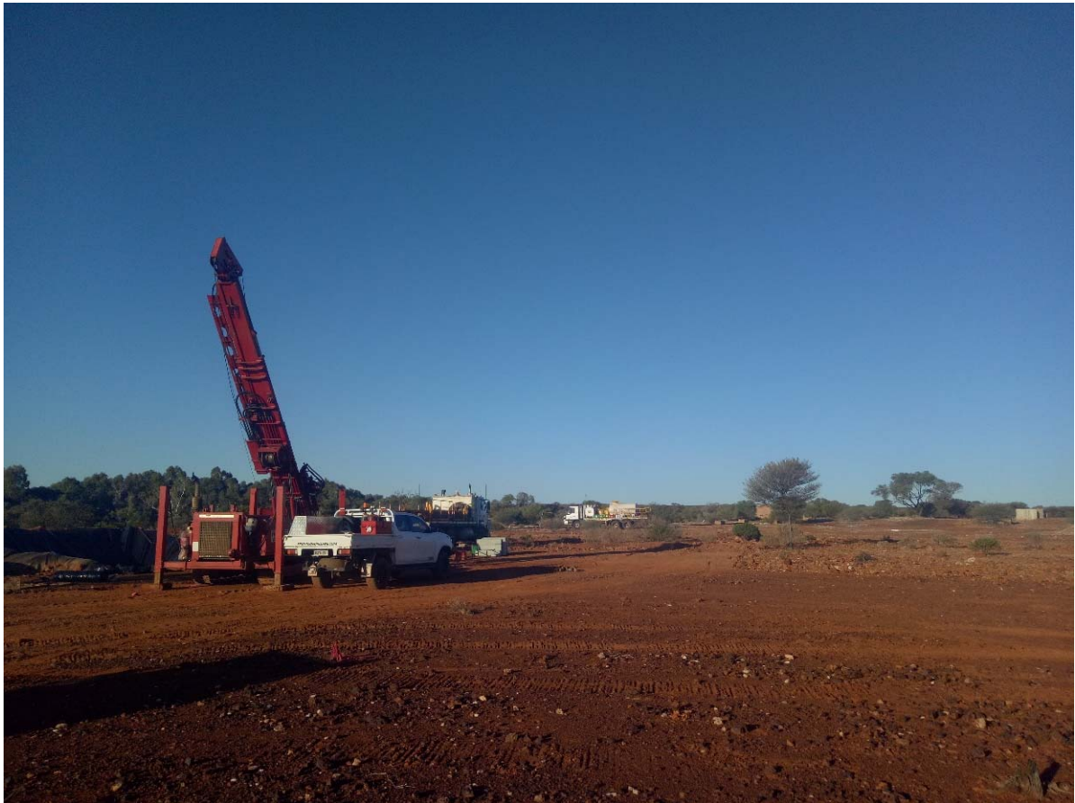
Figure 1. Diamond drill rig at Crown Prince.

This first programme is designed to comprise 12 holes for a total advance of about 2,000m although these figures may change depending on the data generated as the programme progresses.