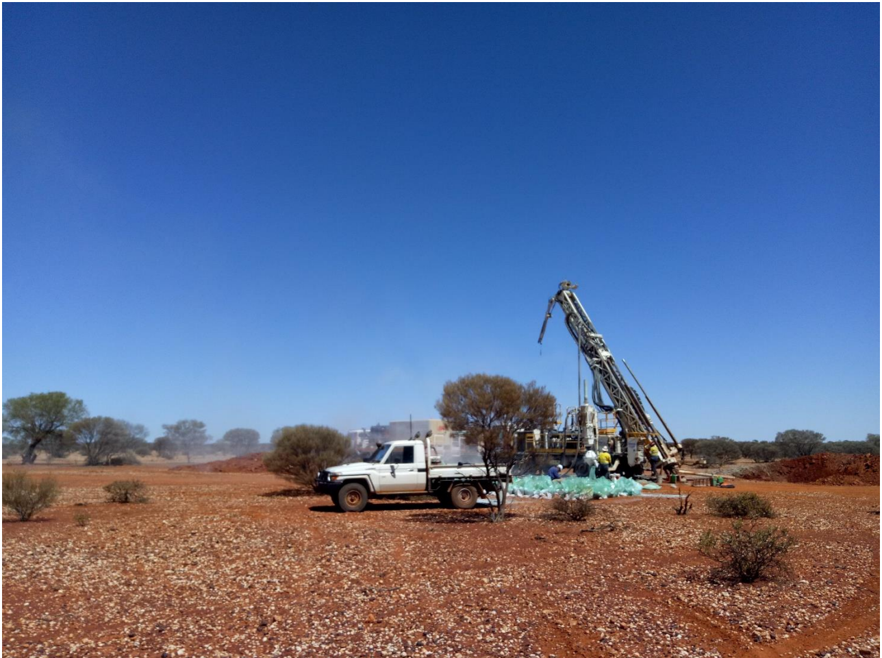
Figure 1. Reverse Circulation drill rig at Lydia Prospect, Garden Gully.

This programme is designed to comprise approximately 13 holes for a total advance of about 3,000 – 3,500m although the final number of holes and the total metreage drilled may change depending on the data generated as the programme progresses.