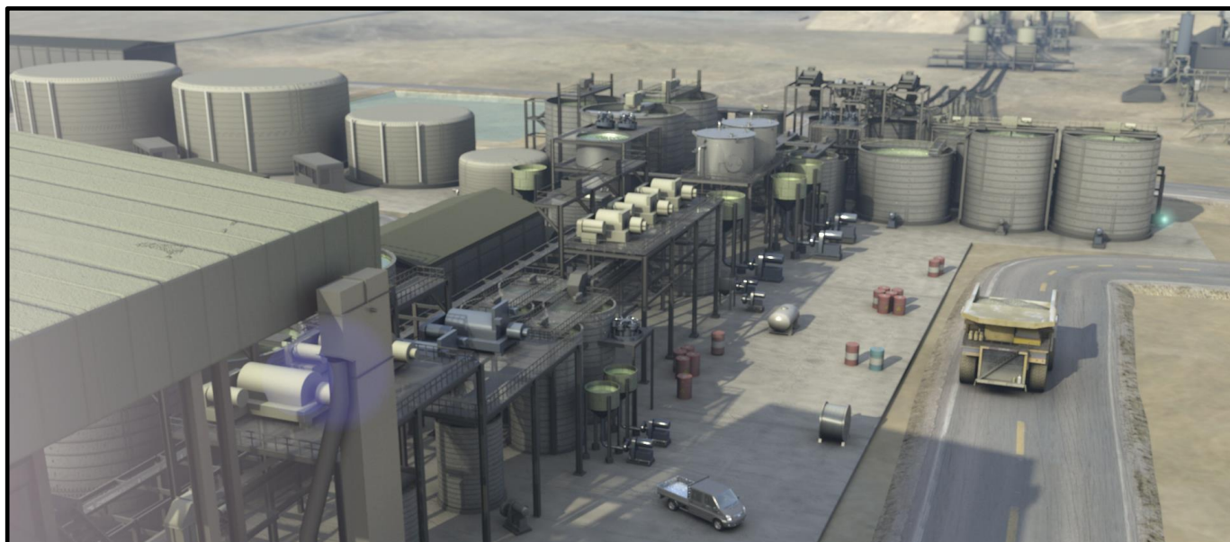
Image: Artist impression of Colluli taken from feasibility study drawings