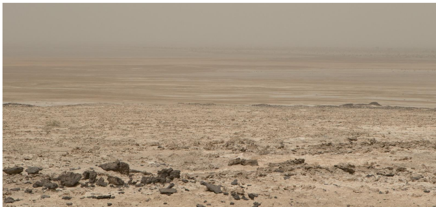
Photo: Colluli hosts over 1.2 billion tonnes of potassium bearing salts 1

The life of mine estimate from the planned DFS production rate is in excess of 200 years. When combined with the diverse range of salts within the resource, low incremental growth capital and highly favourable cost curve position, Colluli demonstrates significant future growth potential over and above the highly favourable DFS outcomes 1 .