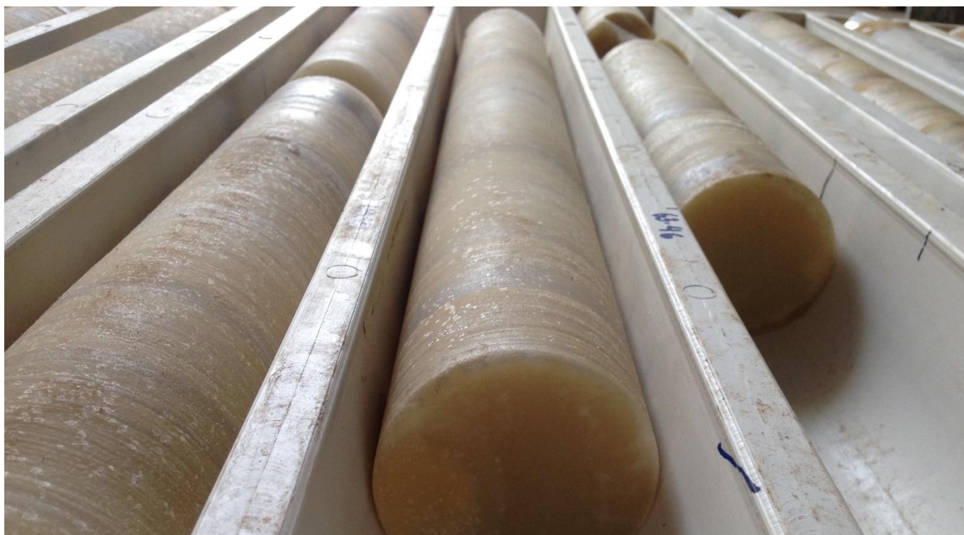
Photo: Colluli Kainite core. Colluli is the ONLY resource globally that allows SOP to be produced from solid form potassium salts

Colluli is the only resource globally where primary production of SOP can be achieved with potassium salts extracted in solid form. This provides two key advantages. Firstly, it negates the need for large evaporation ponds, providing a significant capital intensity advantage relative to brine producers. Secondly, it eliminates the time taken to generate a harvest salt via evaporation, providing immediate revenue generation. Combined, these improve overall project returns and deliver lower development capital intensity relative to brine projects.