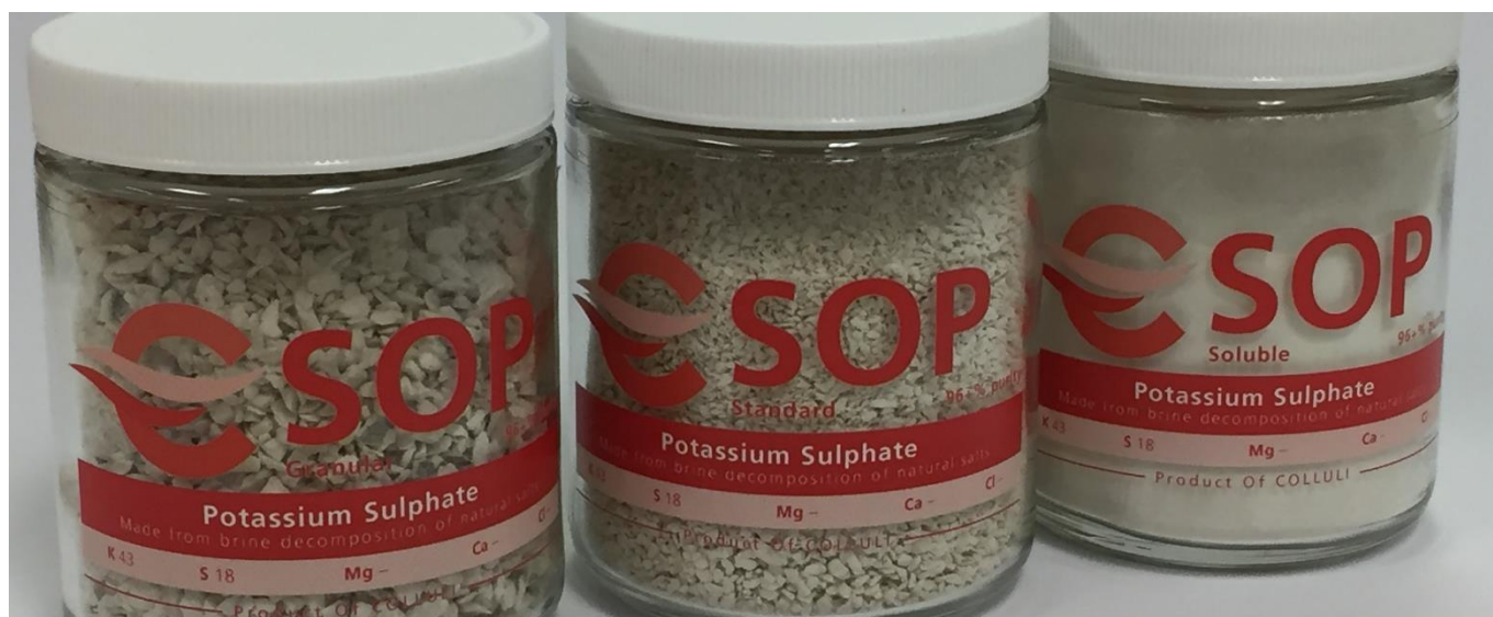
Photo: Colluli product samples generated from Colluli salts in pilot tests

As part of ongoing negotiations, the Company has provided potential parties with samples of Colluli SOP product for testing in their respective laboratories. The samples were produced from Colluli Ore at the Saskatchewan Research Council (SRC) Laboratories in Saskatoon. The feedback from parties following testing confirms that Colluli's SOP samples meet customers' strict quality requirements.