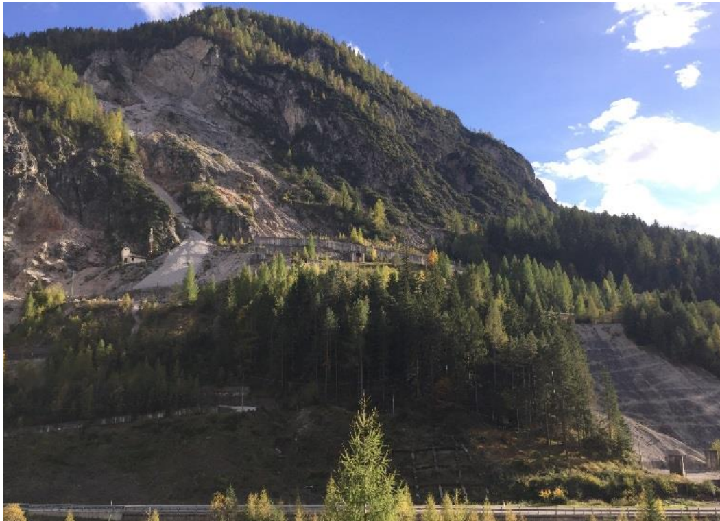
Figure 1 – Salafossa mine historical workings with highway shown in foreground